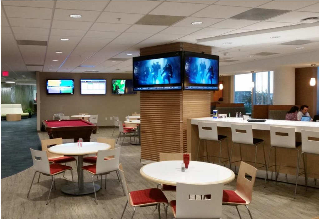
Figure 1: All white surfaces are erasable whiteboards. The monitors display internal company news as well as external news, such as CNN. A pool table allows for relaxation and collaboration.