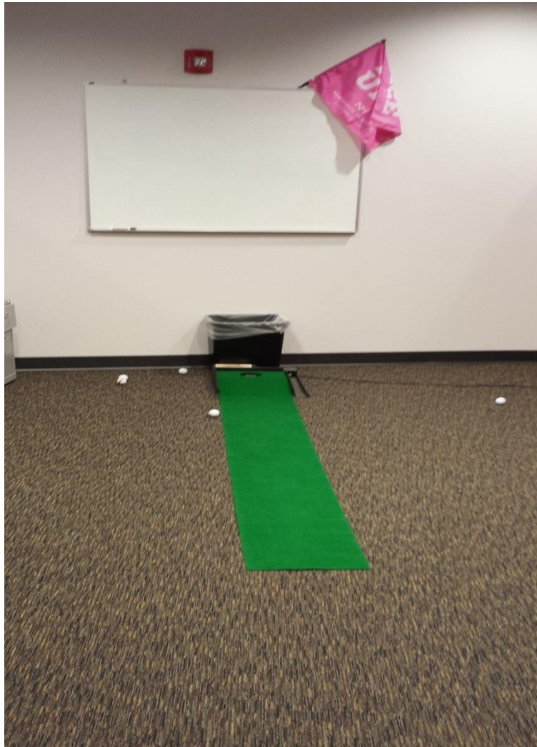
Figure 3: A putting green or chess table offers a brief reprise from sitting at one's desk.