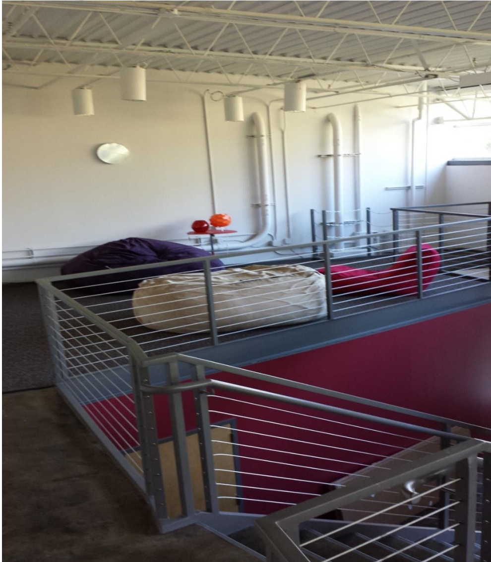
Figure 2: Teams have a space to relax on bean bags and discuss solutions to problems. A whiteboard hangs out of the picture to the left.