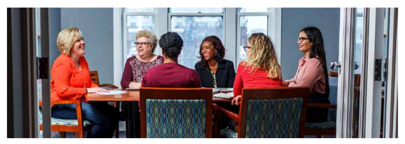
How may we help you? Our clients in government, business, and the nonprofit sector use our work to solve problems, seize opportunities, and improve life in Indiana and beyond. Visit our website to learn more: policyinstitute.iu.edu.