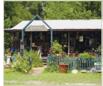
O'Toole's Herb Farm Madison, FL