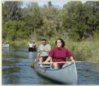
Ichetucknee Family Canoe and Cabins Fort White, FL