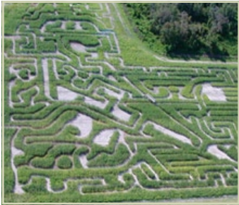
Long & Scott Farms and Corn Maze Adventure Mount Dora, FL