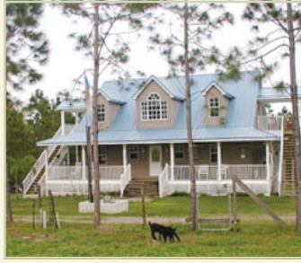
Farmer Brown's Bed & Breakfast Brooksville, FL