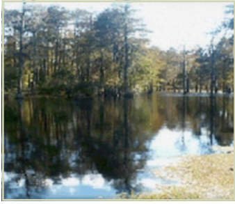
DP Nature Tours White Springs, FL