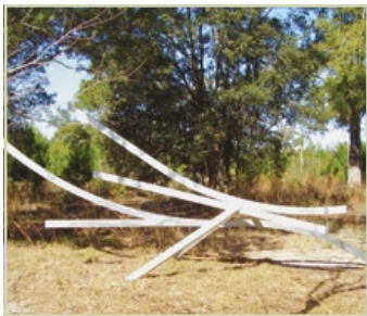
Shoal Sanctuary Mossy Head, FL