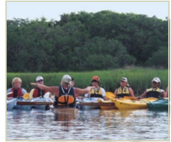
Kayak Amelia Jacksonville, FL