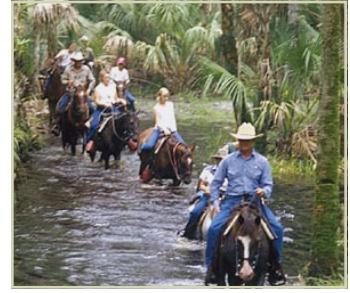
Florida Eco-Safaris St. Cloud, FL