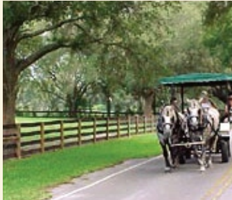
Ocala Carriage & Tours Ocala, FL