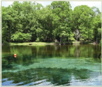
Ginnie Springs Outdoors, LLC High Springs, FL