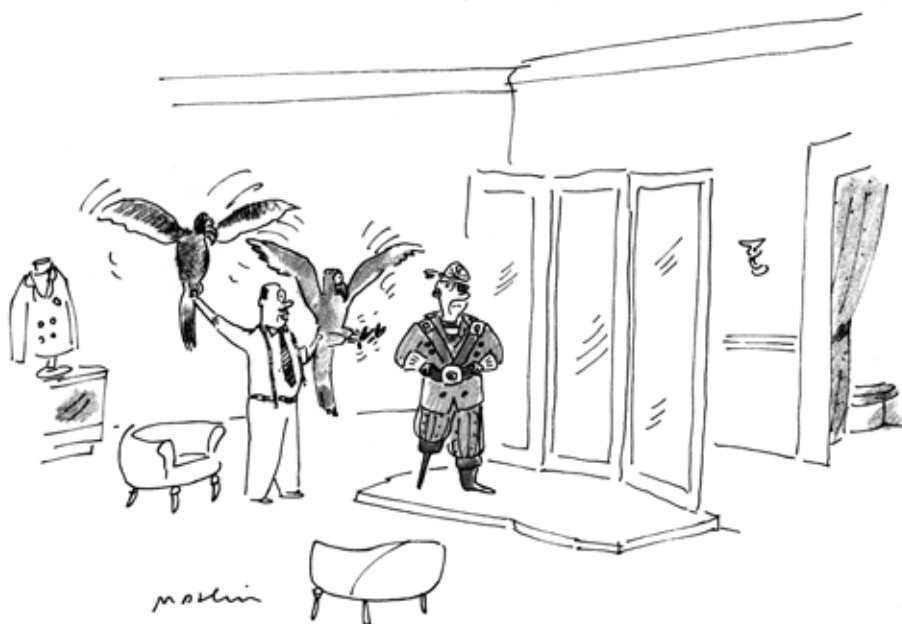
"What about accessories?"