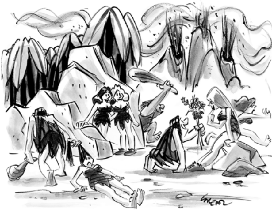
"Lucky girl—she got one before he was hardwired."

Daddy does not travel light, and by the time he reached his hotel suite that evening he expected everything to be in order.