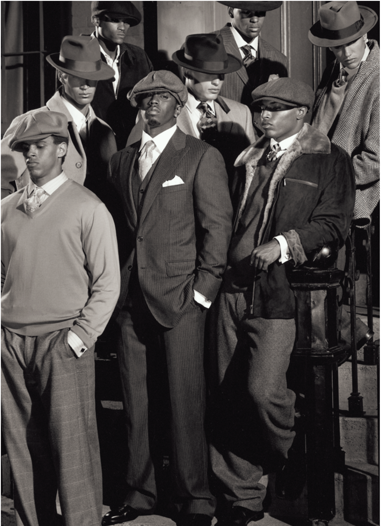
Clothes from the Sean John autumn collection. Combs, center, says, "It's the swagger that I show the world, it's my face, baby."