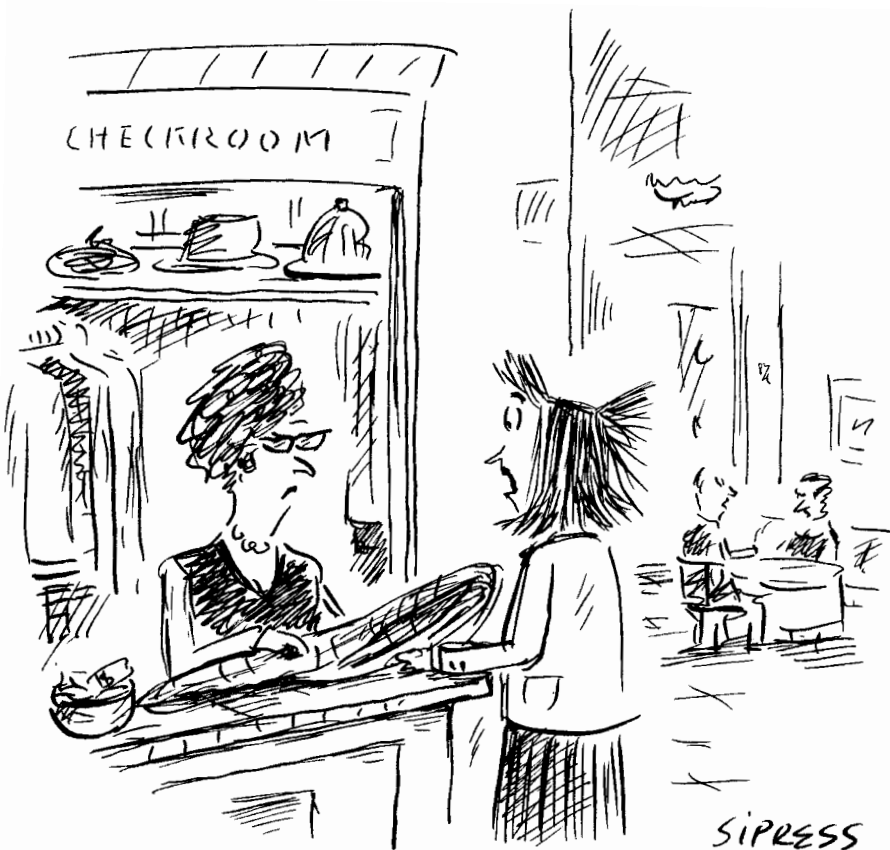
"I had a hat."

From the start, Combs was criticized as a mediocre and derivative rapper. That assessment has not changed, although his 1997 record "No Way Out" sold more than seven million copies and won two Grammys. It is as a talent