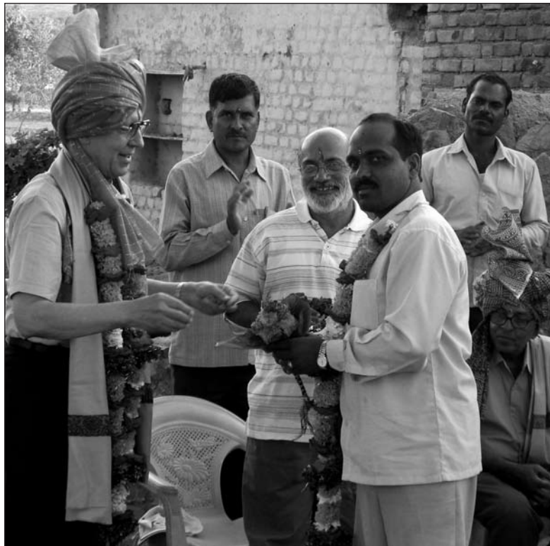
Father Adolfo Nicolas meets with local spiritual leaders while on a trip to India.

we run, if we were re-founding the Society of Jesus in today’s world? I am inviting, in all my visits, all Jesuits to re-create the Society of Jesus, because I think every generation has to re-create the faith, they have to re-create the journey, they have to re-create the institutions. This is not only a good desire. If we lose the ability to re-create, we have lost the spirit. ■