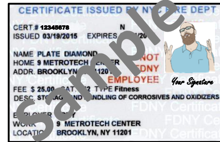
Sample COF card

A Certificate of Fitness (COF) is a certification issued by the New York City Fire Department. These certifications are legally required for most businesses to operate within New York City. The goal of the COF program is to keep this City and the people of this City safe. COF program prepares people to prevent fire by teaching how to safely use, store and handle dangerous materials in the workplace.