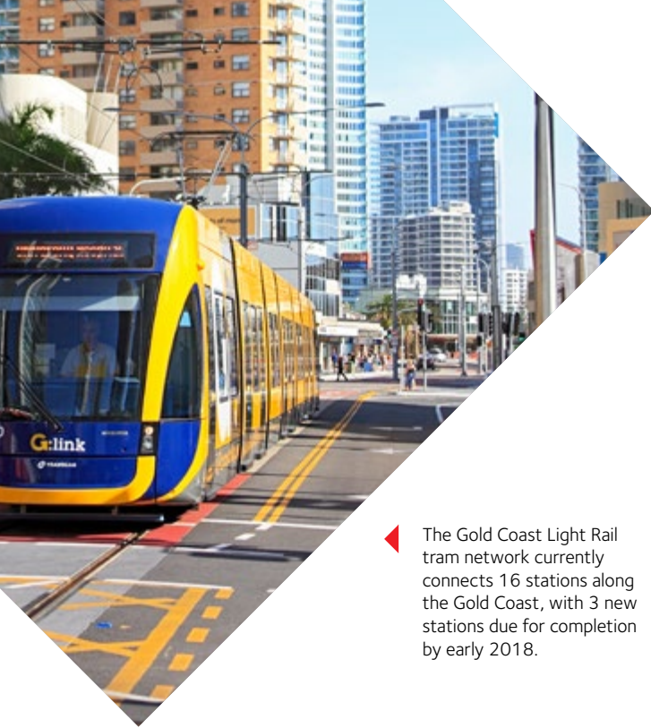
◀ The Gold Coast Light Rail tram network currently connects 16 stations along the Gold Coast, with 3 new stations due for completion by early 2018.