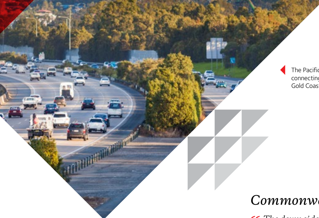
◀ The Pacific Motorway (M1) connecting Brisbane and the Gold Coast