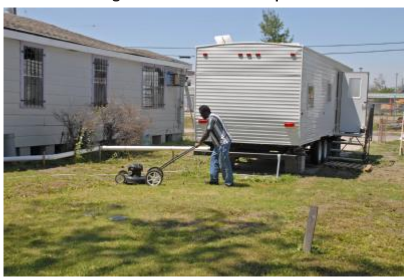
Figure 1.Trailer/Home Repairs

Temporary housing units can be sited in several ways. Traditionally, FEMA provides smaller units (trailers rather than mobile homes) to homeowners repairing their homes (see Figure 1 and Figure 2 ). Members of those households can sleep in the units, sometimes parked in their driveways or on their yards, while making the necessary repairs to make their homes habitable. Small trailer size units that could potentially be moved on short notice, have also been employed for temporary housing in flood plain areas where less mobile forms of housing, such as manufactured homes, would likely not be acceptable under FEMA regulations for flood plain management.<sup>25</sup>