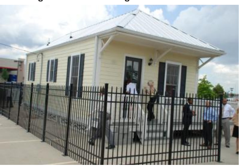
Figure 5. Katrina Cottage Model - Louisiana