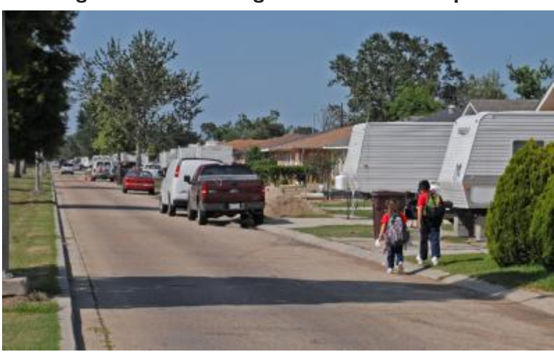
Figure 2. Trailers/Neighborhood Home Repairs