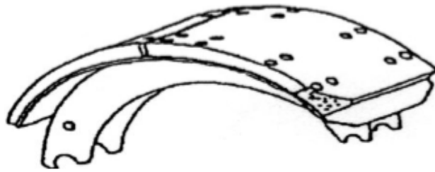
Out-of-Service Portion of lining missing that exposes a fastening device.