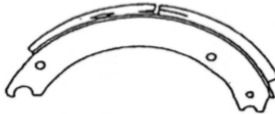
Out-of-Service Cracks or voids that exceed 1/16" in width. Cracks that exceed 1-1/2" in length.