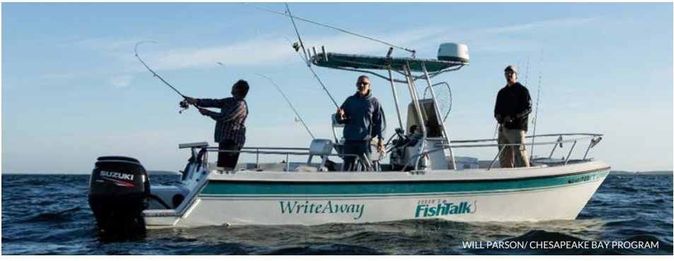
Team Fishtalk Magazine competes in 2017 Rod & Reef Slam Fishing Tournament.