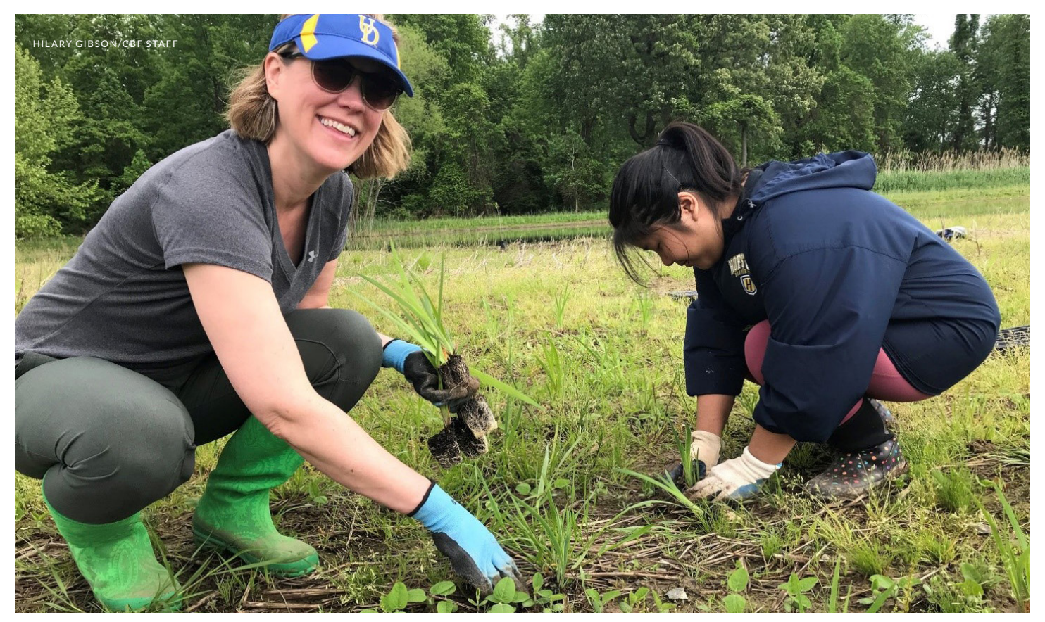
Volunteers help restore a wetland on a Kent County, Maryland farm. The wetland will treat runoff from nearby cropland and create wildlife habitat.