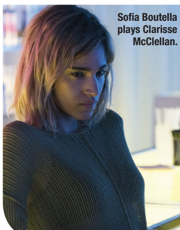
Sofia Boutella plays Clarisse McClellan.

DEBATE The Ministry believes that too much knowledge leads to unrest and even war. The rebel Eels believe that works of art and literature are vital to humanity. Divide the class into two groups and organize a debate to present arguments defending each side.