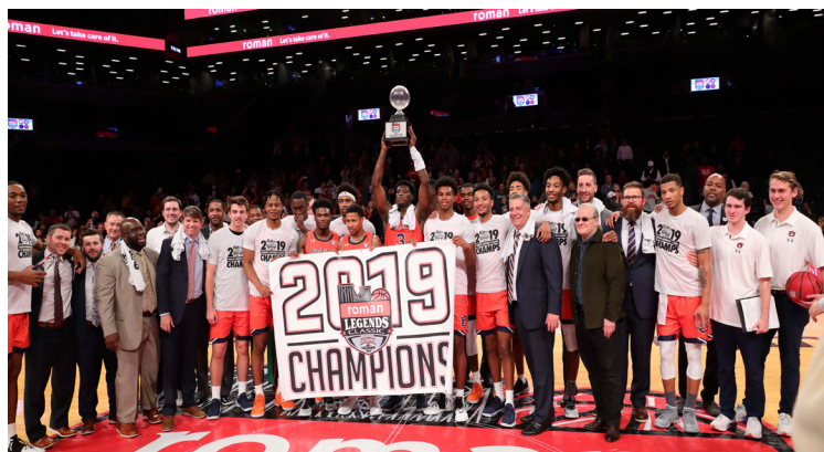
2019 ROMAN LEGENDS CLASSIC presented by OLD TRAPPER CHAMPIONS - AUBURN TIGERS