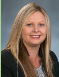
Suzi Brady Royale Parc Hotel Orlando - Lake Buena Vista