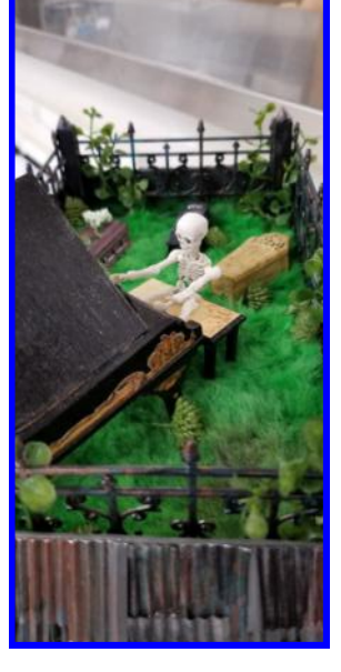
2 Works in Progress, Nevada State Day, All Hallows Fantasy