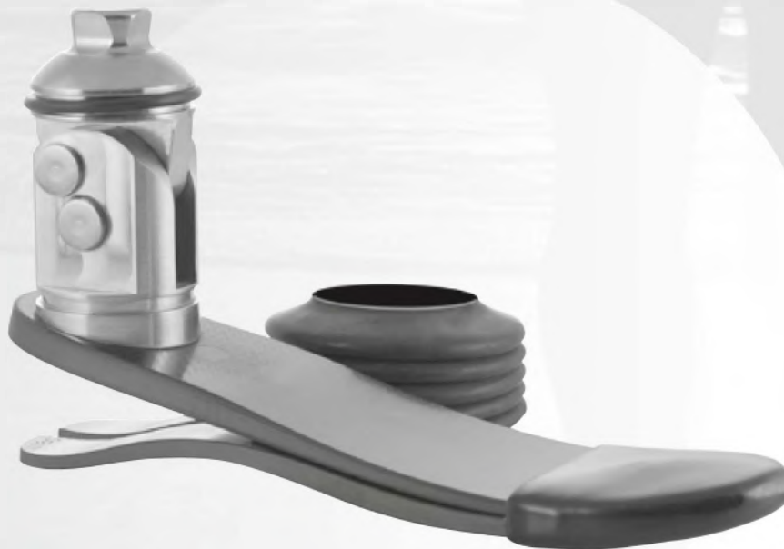
Freestyle Swim (LP2-W2)