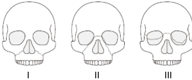
Figure 1. Le Fort 2 fracture patterns.

All of the choices. All of these are true. These fracture patterns are well described and widely reproduced (Figure 1).