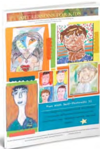
Fun With Self-Portraits II