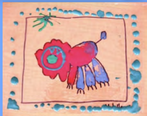
Pretend Stained Glass Art