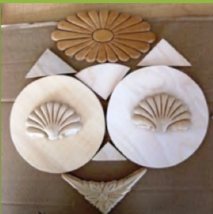
Wooden Scrap Art