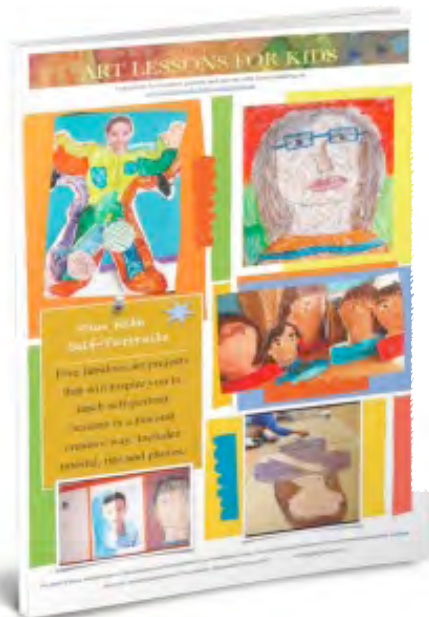
Fun With Self- Portraits