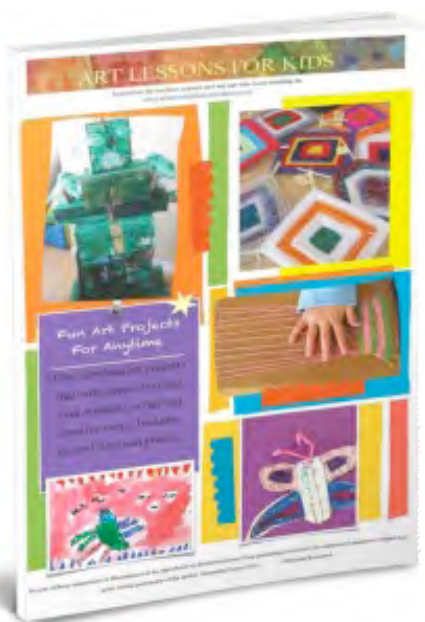
Fun Art Projects for Anytime