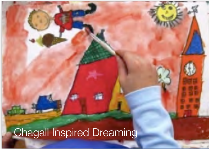
Chagall Inspired Dreaming