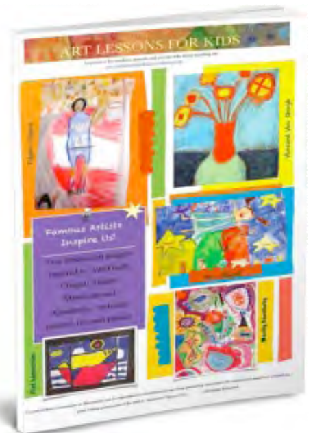
Famous Artists Inspire Us