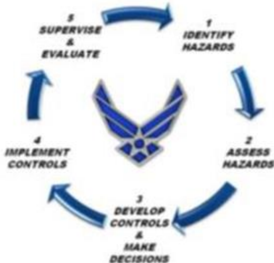
Figure 13.3. The Air Force 5-Step RM Process.

13.1.3.3. Assurance. Safety assurance is how commanders determine the elements of the mishap prevention program are implemented, and guides continuous improvement efforts. The assurance functions of evaluation, monitor, and review measure whether organizations conform to standards and are making progress toward established goals.