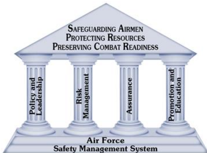
Figure 13.1. AFSMS Pillars.

13.1.2. Leadership implements the mishap prevention program by providing guidance and goals, establishing safety responsibility and accountability, applying risk management to all activities, and promoting the program throughout the organization. The result is a program designed to prevent mishaps, safeguard Airmen, protect resources and preserve combat readiness.