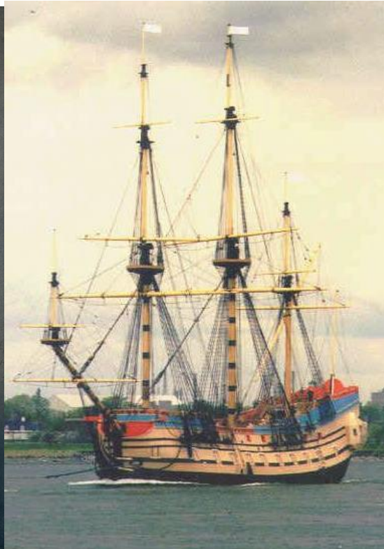
Replica of Le Pélican

Known historically as casket girls or casquette girls, les filles à la cassette (girls with a cassette) were the marriageable women brought over from France to the Louisiana colony as wives for the male colonists. The name derives from the small chests, known as casquettes , in which they carried their clothes and belongings. These young women of admirable character were recruited from church charitable institutions, usually orphanages and convents, and,