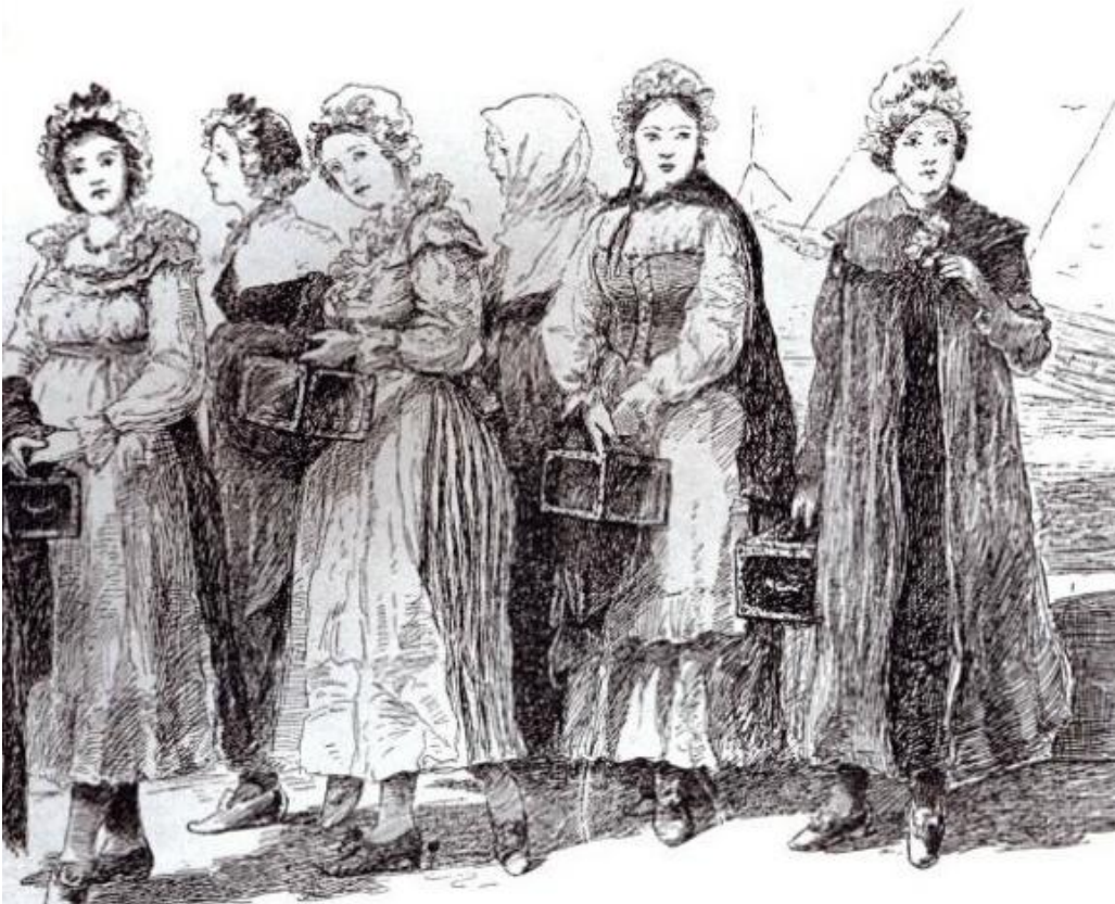
Les filles à la cassette (The casquette girls)

The first consignment of casquette girls reached Mobile, Alabama, in 1704 (as mentioned above); Biloxi, Mississippi, in 1719; and New Orleans, Louisiana, in 1728. They inspired composer Victor Herbert to write the operetta Naughty Marietta , while the shipments of women to Louisiana of more questionable character formed the basis of the short novel Manon Lescaut by Abbé Prévost. The maidens who arrived in 1704 were all well married within a month, except one unusually "coy and hard to please," who would take no man in the colony.