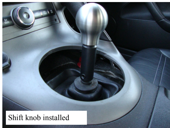
Shift knob installed

Congratulations! You have finished the install. All of us here at DDMWorks thank you for your purchase and hope you enjoy your new shift knob adapter.