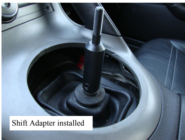
Shift Adapter installed