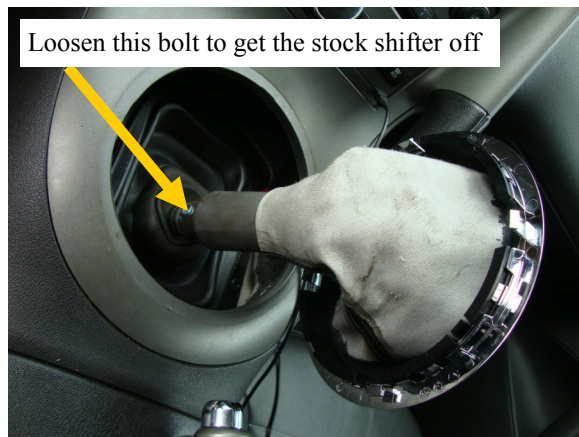
Loosen this bolt to get the stock shifter off