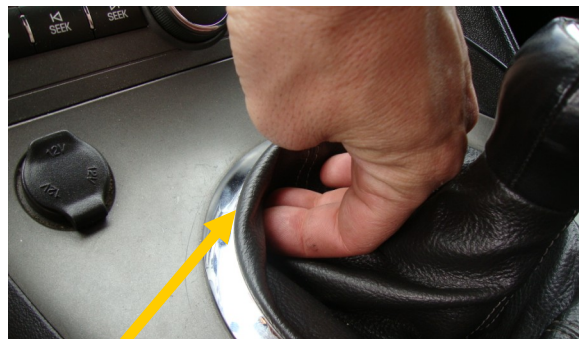
Reach under the front of the ring and lift up