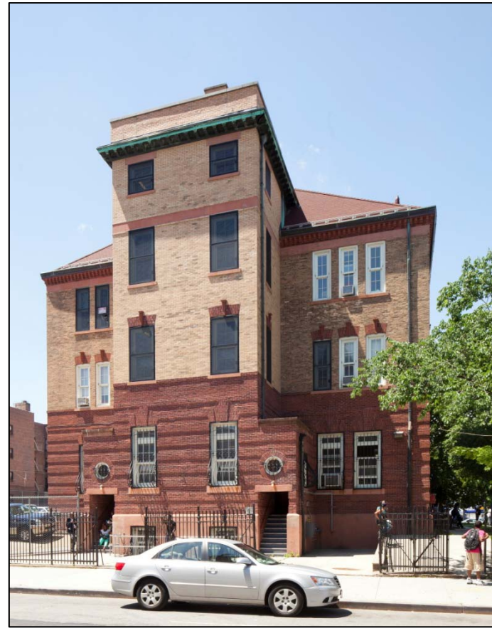
Jamaica High School (now Jamaica Learning Center) Fire stairs on each end of building