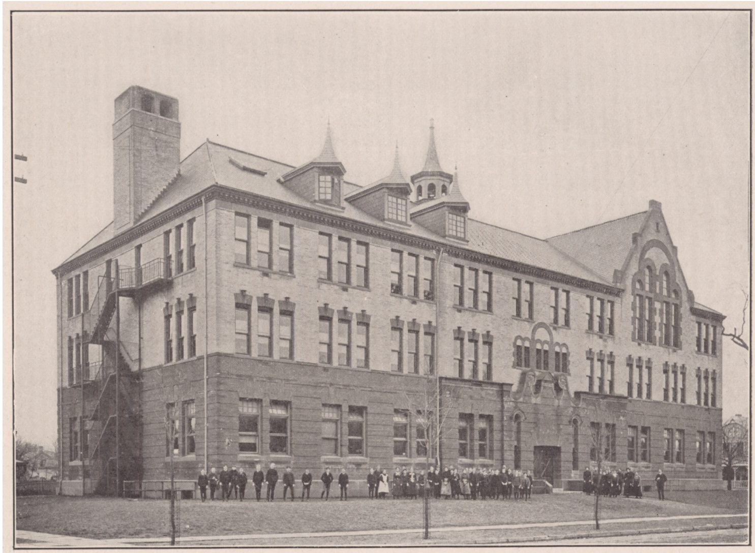
Photograph before 1904, courtesy of New York City Municipal Archives