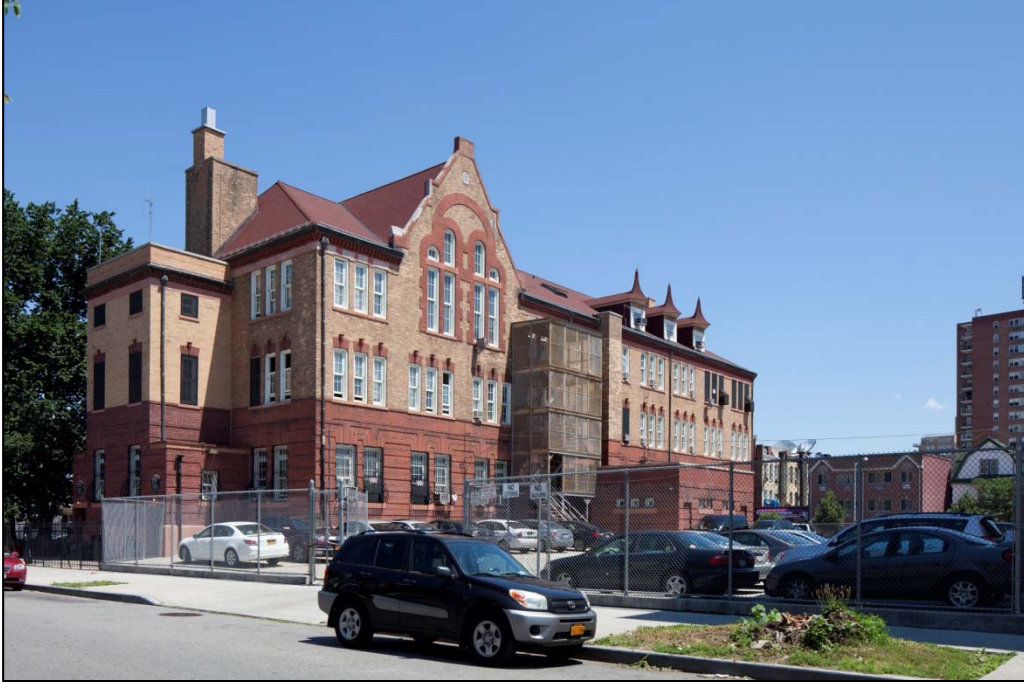
Jamaica High School (now Jamaica Learning Center) Views of rear of building