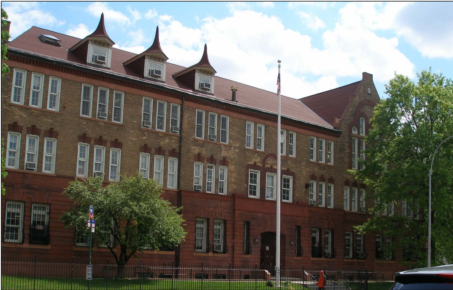
JAMAICA HIGH SCHOOL (NOW JAMAICA LEARNING CENTER) 162-02 Hillside Avenue (aka 88-20 163 rd Street), Queens Borough of Queens Tax Map Block 9768, Lot 22