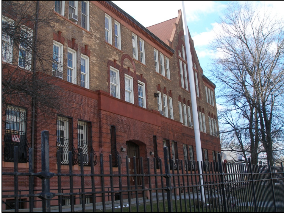
Jamaica High School (now Jamaica Learning Center) Views of front of building