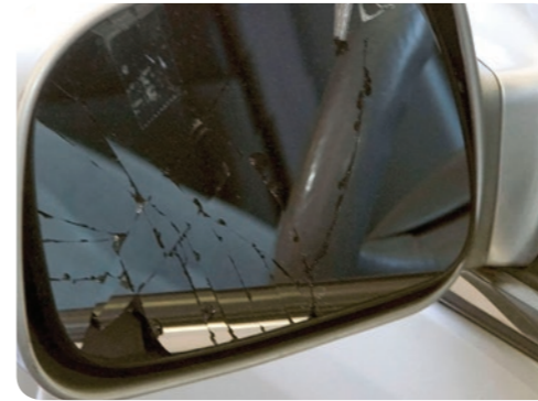
9. Broken Mirror