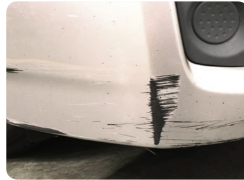
6. Scratched Bumper