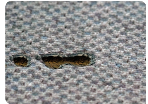
2. Burned Fabric