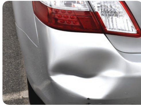
5. Dented Bumper