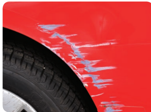
7. Scratched Panel