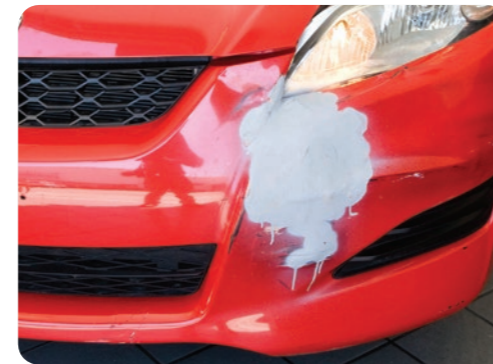
8. Poor Repair