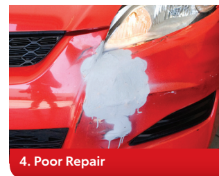
4. Poor Repair