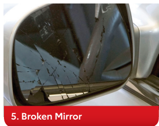
5. Broken Mirror