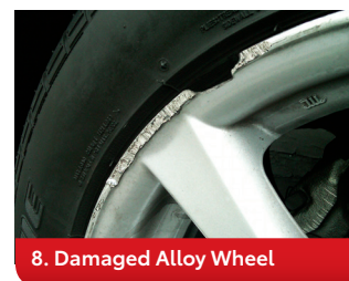
8. Damaged Alloy Wheel