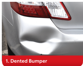
1. Dented Bumper

The following are examples of excessive wear and use found on the exterior of a vehicle 1 .