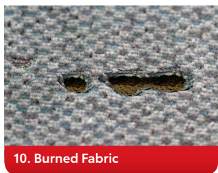
10. Burned Fabric