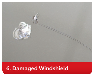
6. Damaged Windshield