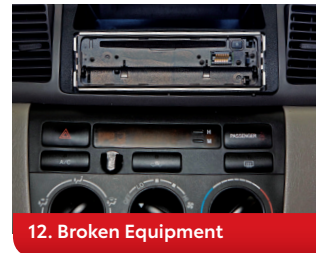
12. Broken Equipment