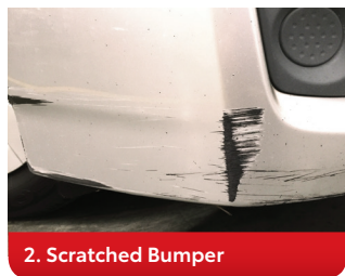
2. Scratched Bumper