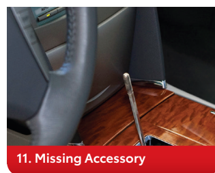
11. Missing Accessory