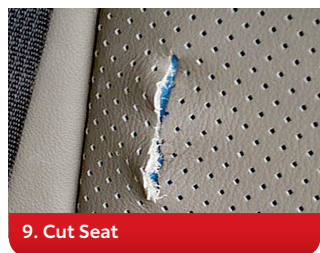
9. Cut Seat

The following are examples of excessive wear and use found on the interior of a vehicle 1 .