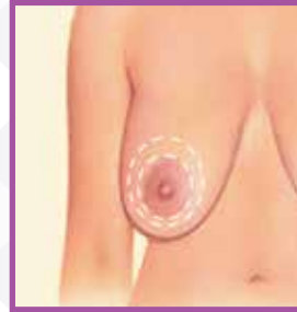
1) Around the areola

There are three common incision patterns: