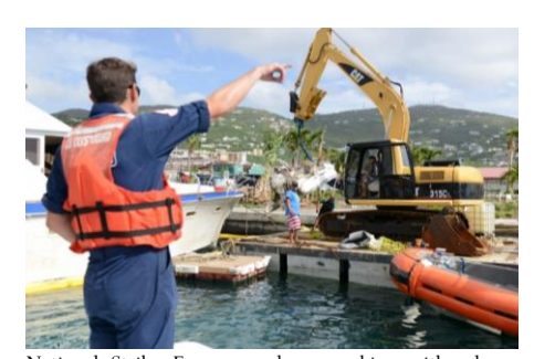
National Strike Force members working with salvage contractors in Crown Bay on St. Thomas, U.S. Virgin Islands.

The Coast Guard is the lead federal agency for directing the removal and mitigation of oil and hazardous substances from spills and releases in the waters and shorelines of the coastal zone. The Coast Guard accomplishes this marine environmental response and preparedness mission with strategically distributed marine environmental response program elements at the national, regional, and local level. This includes strategic program management and policy support at Coast Guard Headquarters and National Contingency Plan Special