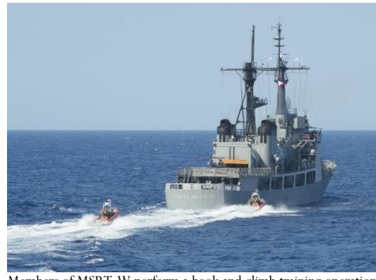
Members of MSRT-W perform a hook and climb training operation with Philippine Navy frigate BRP ANDRÉS BONIFACIO (Former USCGC BOUTWELL) as part of the 2018 RIMPAC exercise.

homeland security and homeland defense operations, either under Coast Guard control or under the control of a Department of Defense (DoD) Geographic Combatant Commander (GCC). As an armed service, the Coast Guard provides uniquely trained, equipped and mission-matched forces in support of GCC initiatives, as outlined in the 2008 DoD-DHS Memorandum of Agreement. Coast Guard Defense Operations missions include: Maritime Interception/Interdiction Operations; Military Environmental Response; Port Operations, Security and Defense (including maintaining a Title