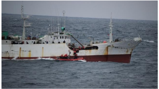
Joint Chinese and U.S. Coast Guard inspection team boards the Run Da , June 16 2018.

In June of 2018, while on routine patrol, a Coast Guard cutter with embarked Chinese law enforcement ship-riders interdicted and boarded a Chinese fishing vessel suspected of utilizing