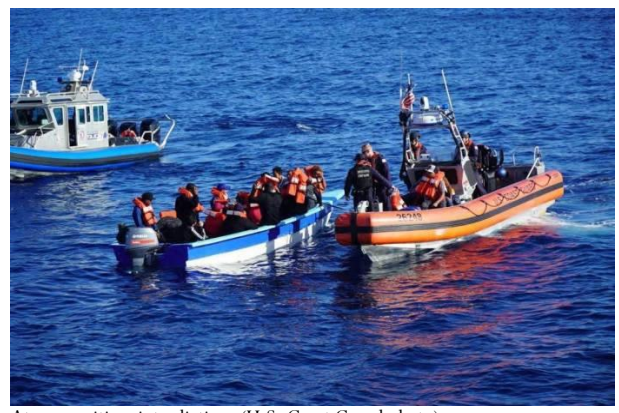
At sea maritime interdiction.

Coast Guard interdiction of undocumented migrants provides effective law enforcement presence at sea and achieves the three main objectives of safe, legal, and orderly migration. Coast Guard migrant interdiction operations also stem the flow of human smuggling and trafficking through maritime routes and approaches to the United States. Leveraging statutory authority, bilateral agreements and policy, the Coast Guard conducts these interdictions as far from U.S.