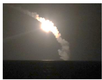
USCGC ADAK and AQUIDNECK provide layered defense for USS HIGGINS during strikes on suspected military targets in Syria.

Coast Guard cutters assigned to Patrol Forces Southwest Asia (PATFORSWA) provided short notice layered defense for USS HIGGINS (DDG 76) in the Northern Arabian Gulf during Tomahawk Land Air Missile strikes against suspected chemical weapons targets in Syria. The PATFORSWA Maritime Engagement Team (MET) also conducted visit, board, search, and seize training exchanges with coalition forces operating in support of Combined Task Force 150, whose mission includes disrupting terrorist organizations and related illegal activities within an area that includes the Red