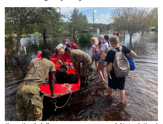
Coast Guard shallow water rescue team and National Guard members rescue residents near Old Dock, NC on September 18, 2018.

The Contingency Preparedness and Exercise Policy Program establishes processes and procedures