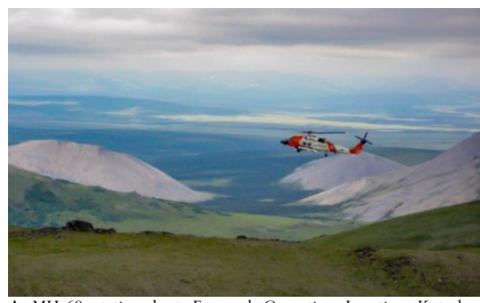
A MH-60 stationed at Forward Operating Location Kotzebue conducts confined space landing training as part of Arctic Shield 2018.

One notable case was a medical evacuation on August 3, 2018 of a passenger from the Bahamian-flagged cruise ship SILVER EXPLORER , carrying