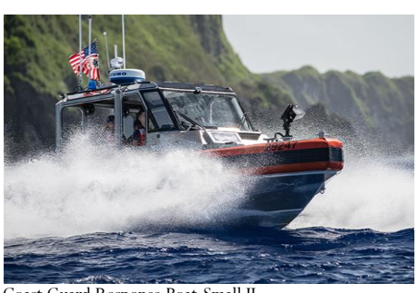
Coast Guard Response Boat-Small II.

The PWCS-Response Activities (PWCS-R) mission of the Maritime Security Operations Program is to prevent and disrupt terrorist attacks, sabotage, espionage, or subversive acts in the maritime domain and MTS. Coast Guard Maritime Security Operations deny the use and exploitation of the MTS by terrorists as a means for attacks on U.S. territory, population centers, vessels, and critical maritime infrastructure and key resources. Coast Guard PWCS-R efforts include establishment and