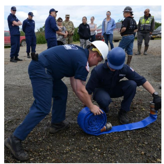
Pacific Strike Team and Sector Juneau crewmembers, work together to coil a hose after an oil spill response demonstration in Bethel, AK, July 25, 2018.

Building Partnerships for Arctic Oil Spill Prevention, and Response. As part of Operation Arctic Guardian, personnel from the Coast Guard, National Oceanic and Atmospheric