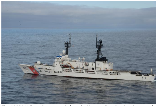
The USCGC Mellon and crew patrol along the Maritime Boundary Line between the U.S. and Russia in the Bering Sea, May 25, 2018. The crew kept a lookout for illegal encroachments of the U.S. Exclusive Economic Zone by foreign fishing vessels.

In FY 2018, there were 201 detected incursions of foreign fishing vessels in U.S. waters, a 48% increase from the 136 detected incursions in FY 2017. Coast Guard units interdicted 63 incursions,