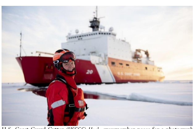
U.S. Coast Guard Cutter (USCGC) Healy crewmember poses for a photograph during support for the Office of Naval Research north of Barrow, AK, in the Arctic.

The United States has been an Arctic Nation since 1867, when it purchased Alaska from Russia for $7.2 million. The U.S. has significant equities in the region, and the Coast Guard is responsible for ensuring safe, secure, and environmentally responsible maritime activity throughout this domain. This includes exercising maritime sovereignty and maintaining persistent maritime domain awareness in the Arctic; providing effective maritime border control; overseeing and ensuring the