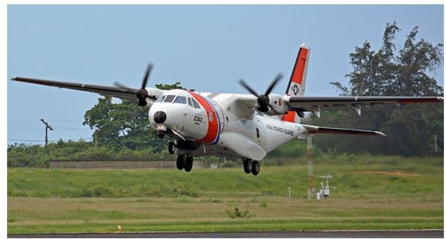
HC-144 Ocean Sentry Aircraft.

identified human trafficker had been previously arrested. One of the migrants had a previous arrest by Immigration and Customs Enforcement for illegal drug charges, and another was apprehended for previous illegal weapons charges, possession of stolen property, and larceny. Approximately $25,000 in U.S. currency and $2,200 Bahamian currency were also seized from the vessel.