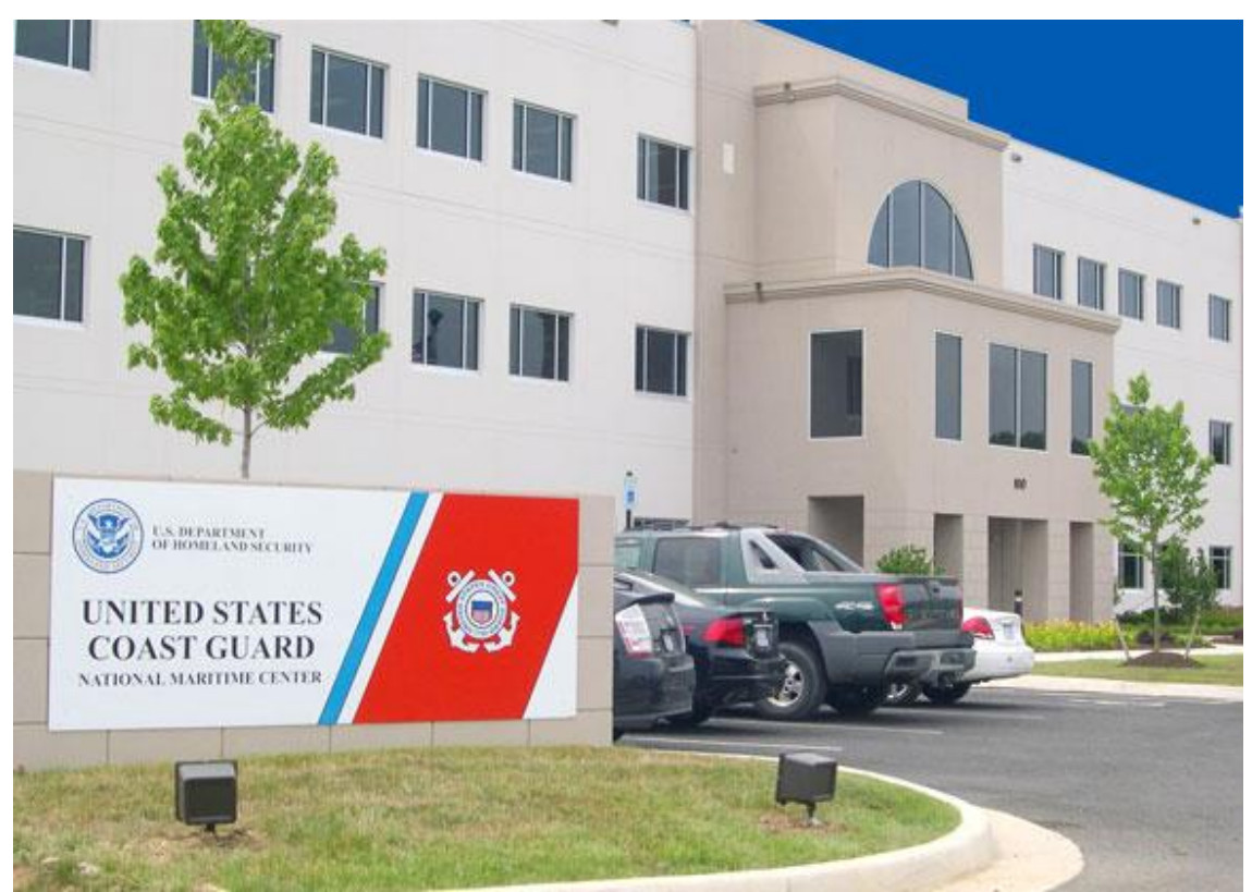
National Maritime Center, Martinsburg, WV.

The Coast Guard's mariner credentialing provider—the National Maritime Center (NMC)—made significant strides in 2018 to improve service, maintaining an average customer satisfaction score of 96.5%. Mariners are now able to apply directly to the NMC to renew their medical certificates, avoiding up to seven days of processing for applications made at Regional Examination Centers. More than 13,000 mariners took advantage of this opportunity. Improved centralization also allows 99.5% electronic conversion and transfer of mariner credential applications, which further reduced processing and shipping time.