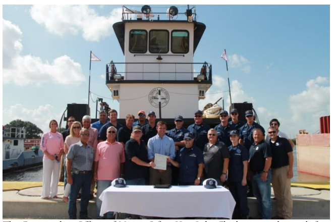
The Commanding Officer of Marine Safety Unit Lake Charles issues the area's first Certification of Inspection under the new Subchapter M towing vessel regulations to Devall Towing and Boat Services on August 15, 2018.

Subchapter "M" Implementation Begins. Towing vessels are essential to America's commerce,