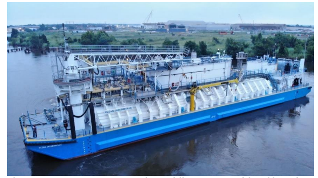
The CLEAN JACKSONVILLE LNG barge following successful Cold Trials in Orange, TX.

Center of Expertise, Marine Safety Center, Headquarters Prevention offices, Coast Guard field units, and the marine industry collaborated extensively to establish an appropriate regulatory framework to facilitate construction and operation of LNG fueled ships. As a result of this cooperation, there were six LNG fueled vessels operating in the U.S., including two Tote containerships and four Harvey Gulf offshore supply vessels.