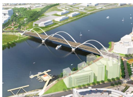
Artist's rendering of the new Frederick Douglass Memorial Bridge. (Rendering courtesy of the District of Columbia Department of Transportation)

The Coast Guard collaborates with federal, state, local agencies, industry, and other stakeholders to ensure that over 20,000 bridges and causeways spanning the navigable waters of the United States do not unreasonably obstruct navigation. This includes issuing permits, establishing bridge lighting and marking requirements; approving drawbridge schedules; investigating bridges that may be unreasonably obstructive; monitoring rehabilitation, repair, maintenance and construction activities; and managing design construction and funding for Truman-Hobbs bridge projects.