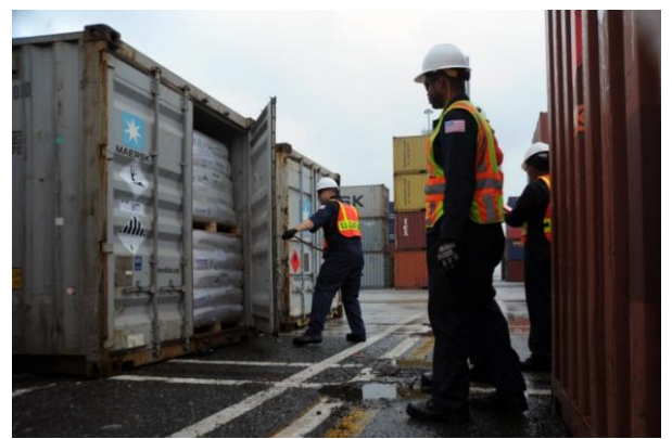
Container inspectors from Coast Guard Sector Maryland-National Capital Region perform inspections of hazardous shipments at Port of Baltimore, MD.

develops regulations and operating standards for domestic vessels and marine facilities and advocates for responsible environmental and operational standards at the IMO and the International Organization for Standardization. The Coast Guard enforces standards by conducting vessel examinations and inspections, performing inspections and spot-checks of waterfront facilities, and conducting criminal investigations into violations. The Coast Guard conducts transfer monitoring activities to ensure