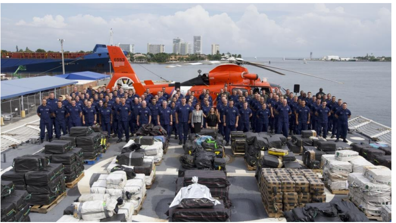
Members of the U.S. Coast Guard Cutter (USCGC) ESCANABA crew stand next to approximately 12.4 tons of cocaine December 7, 2017.

The Drug Interdiction mission supports national and international strategies to deter and disrupt the