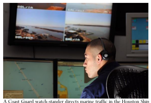
A Coast Guard watch-stander directs marine traffic in the Houston Ship Channel at Sector Houston-Galveston. The Houston-Galveston Vessel Traffic Service was established in 1975 to improve maritime safety and efficiency in the largest petrochemical port in the United States.

The Waterways Management program leverages other federal agencies, harbor safety committees, pilots, port authorities, and other industry and waterway stakeholders to foster a safe, secure, resilient, and environmentally sound MTS. This includes cooperative work with the U.S. Army Corps of Engineers, National Oceanic and Atmospheric Administration, Marine Board of the Transportation Research Board, the Committee on the Marine Transportation System, and regional Federal Advisory Committee Act members.