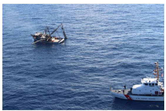
The fishing vessel Master D on fire approximately 40 miles east of Port Isabel, TX, August 31, 2018. All three crewmembers from the fishing vessel were rescued by the crew of the Coast Guard Cutter Coho after activating the vessel's emergency position-indicating radio beacon.

The Coast Guard is the lead agency for maritime Search and Rescue (SAR) in U.S. waters. The Coast Guard also works with other nations through the International Maritime Organization, International Civil Aviation Organization, and other regional forums to save lives and advance the SAR system both nationally and globally. The Coast Guard strives to alleviate human suffering and minimize loss of life and property by rendering aid to those in distress in the maritime environment and elsewhere when Coast Guard intervention can influence the outcome of life-threatening incidents. The Coast