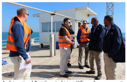
An International Port Security Liaison Officer, discusses security procedures with Khor al-Amaya Oil Terminal security personnel in Iraq.

The focus of the Coast Guard's Ports, Waterways and Coastal Security— Prevention Activities is to prevent security incidents, including terrorist attacks, sabotage, espionage, or subversive acts in the maritime domain, upon the global supply chain, or to the U.S. MTS. It also seeks to improve security in the world's ports and thus reduce risk to the Nation. The Coast Guard strives to deny terrorists the ability to use or exploit the maritime domain or MTS as a means for attacks on U.S. territory,