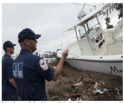
Members of the National Strike Force assess vessels impacted by Hurricane Harvey at Port Aransas, TX.

From August 2017 to April 2018, the Coast Guard led the National Response Framework Emergency Support Function-10 response to Hurricanes Harvey, Irma, and Maria. Managing the catastrophic impacts of several major hurricane landfalls was unprecedented and required a complex approach. The Coast Guard worked with other federal agencies, state officials, and thousands of salvage and environmental professionals to remove 4,215 vessels and significant pollutants from the environment over the course of a 10-month response.