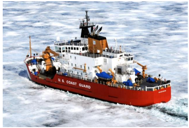
The Great Lakes Icebreaker U.S. Coast Guard Cutter (USCGC) MACKINAW breaks a shipping lane free of ice in support of Operation Taconite in Lake Superior. Operation Taconite is the largest domestic icebreaking operation in the United States, ensuring the primary means of transporting vast amounts of iron ore from mines bordering Lake Superior needed to meet the demands of steel mills in Lake Erie and Lake Michigan.

Northeastern U.S. connecting waterways open for commercial traffic, assist vessels transiting ice-filled waterways, and prevent ice-related flooding. The International Ice Patrol promotes safe navigation by monitoring icebergs and broadcasting the iceberg geographical limit to vessels transiting the North Atlantic between North America and Europe. Coast Guard Polar icebreakers uphold national security and sovereignty, and support National Science Foundation missions in the Polar Regions. They are used to determine and demonstrate the extent of U.S. Extended Continental