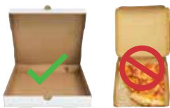
Recyclables must be free of food, grease and liquids