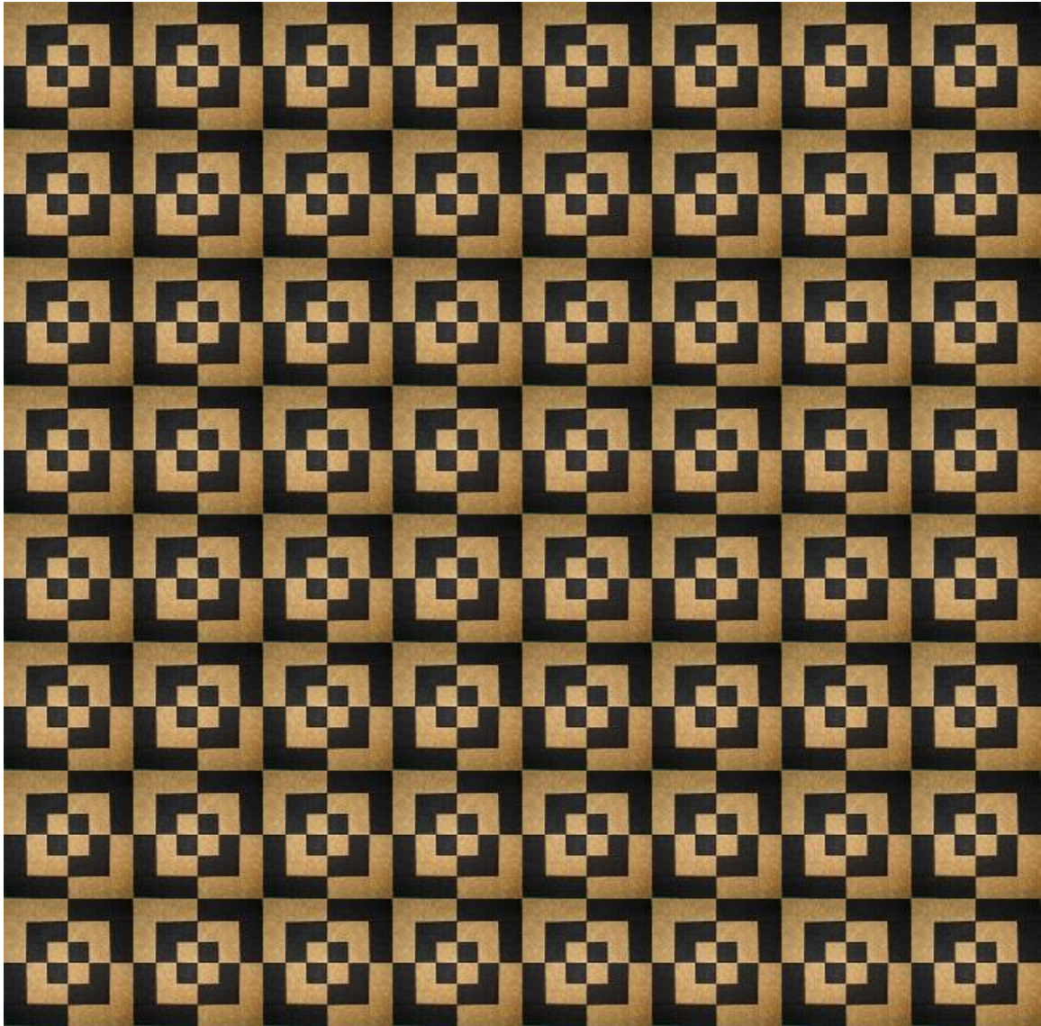
96" x 96" Queen Size

This block can be made in any two (or more) colors you like, but will be more striking with a dark and light color! It's extremely easy to make using 2.5" strips. 20-strip rolls will be the most efficient use of fabric for this pattern - you can find all our 20-strip rolls here !