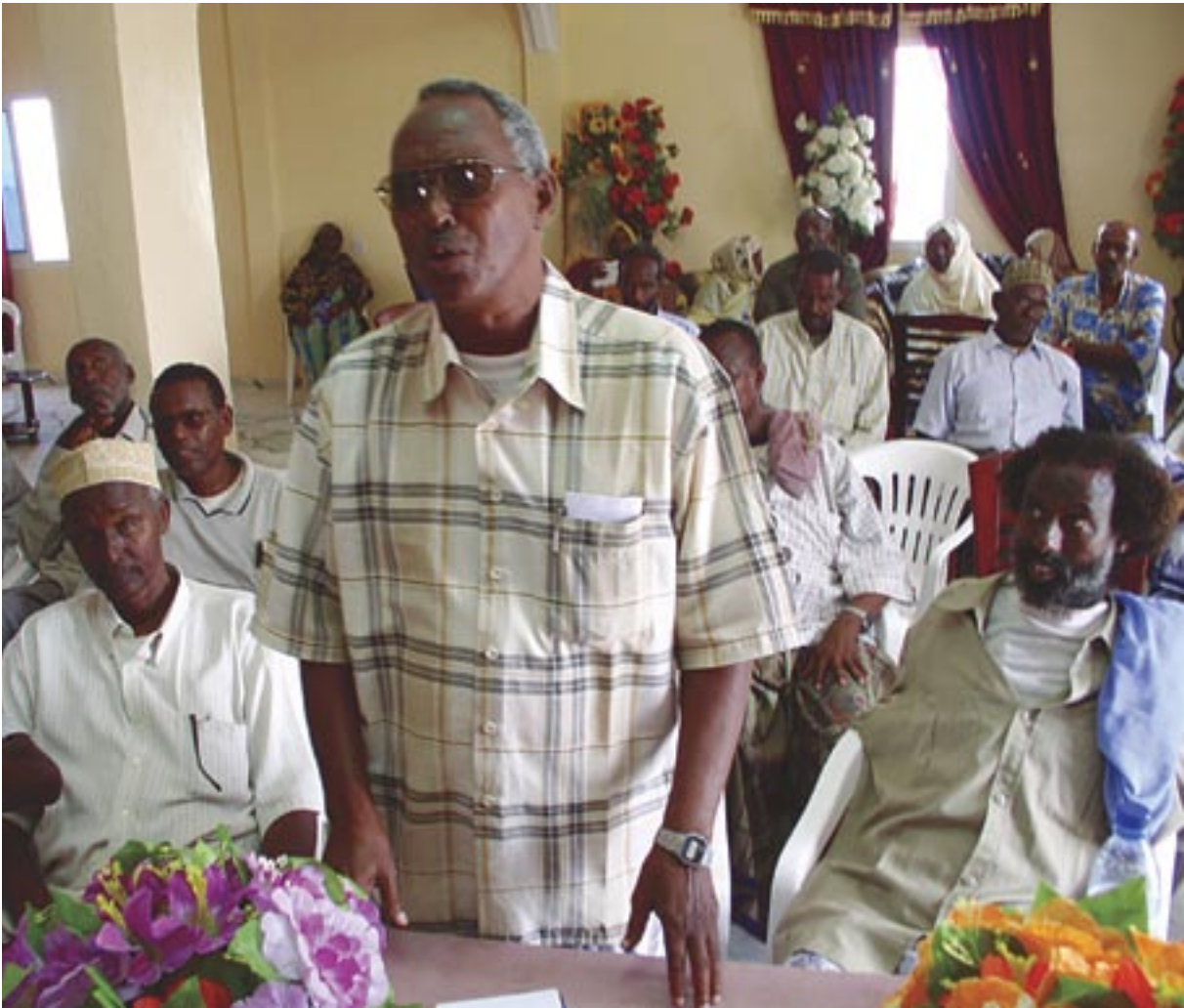
Elders at a conflict resolution meeting in Galkayo.

At the same time, one of WSP's other partner institutions, the Mogadishu-based Center for Research and Dialogue (CRD), was engaged in broad discussions in the capital with key political leaders and deal-makers from south-central Somalia with regard to the resolution of the enduring conflict in South Mudug.