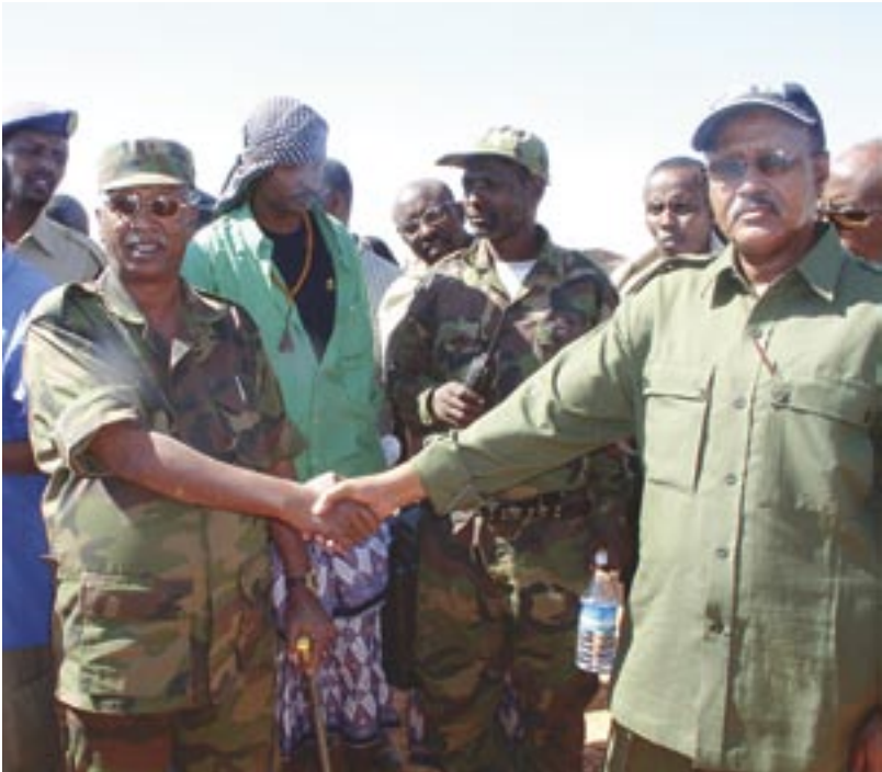
Commanders shake hands at the prisoner exchange ceremony.