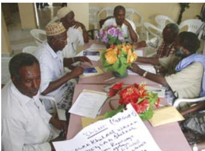
Working session on conflict management.

Following the consultative meeting, the PDRC hosted a two-day training workshop in Galkayo on conflict management for the communities of North Mudug on April 16th-17th 2006. Forty participants,