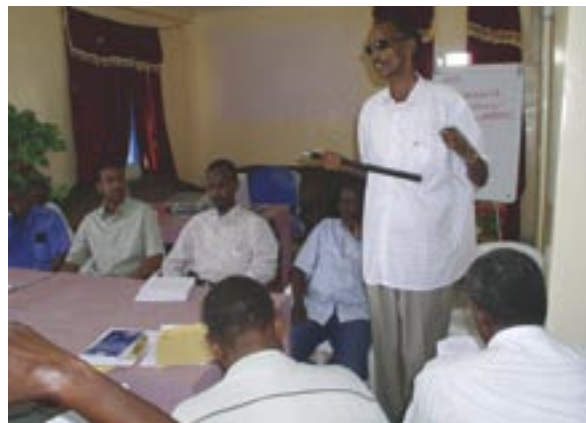
PDRC and CRD staff with participants during a discussion on conflict management.

Political shifts within the senior Somali leadership in the latter half of the project period unexpectedly enabled the WSP/PDRC/CRD partnership to contribute to progress in the resolution of the Mudug-Galguduud conflict. The ground for this assistance had been well prepared over the previous year through a consistent process of sensitising and motivating community leaders in North Mudug to engage in further dialogue with their southern neighbours. The Dialogue for Peace partners were also instrumental in supporting a significant reconciliation initiative with traditional elders and opinion-makers in North Galkayo, and in engaging key deal-makers in Mogadishu and south-central Somalia in the South Mudug peace process.