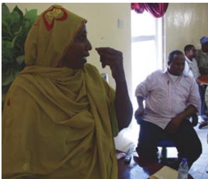
Workshop on conflict management.