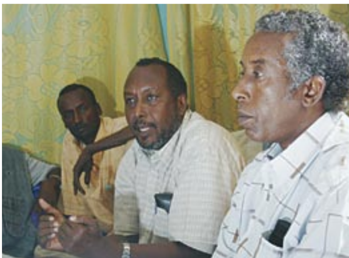
PDRC & CRD staff in discussion with elders.

These mediation efforts succeeded and the majority of the South Mudug militia returned to their base in Hobyo. Furthermore, the South Mudug elders showed their willingness for further