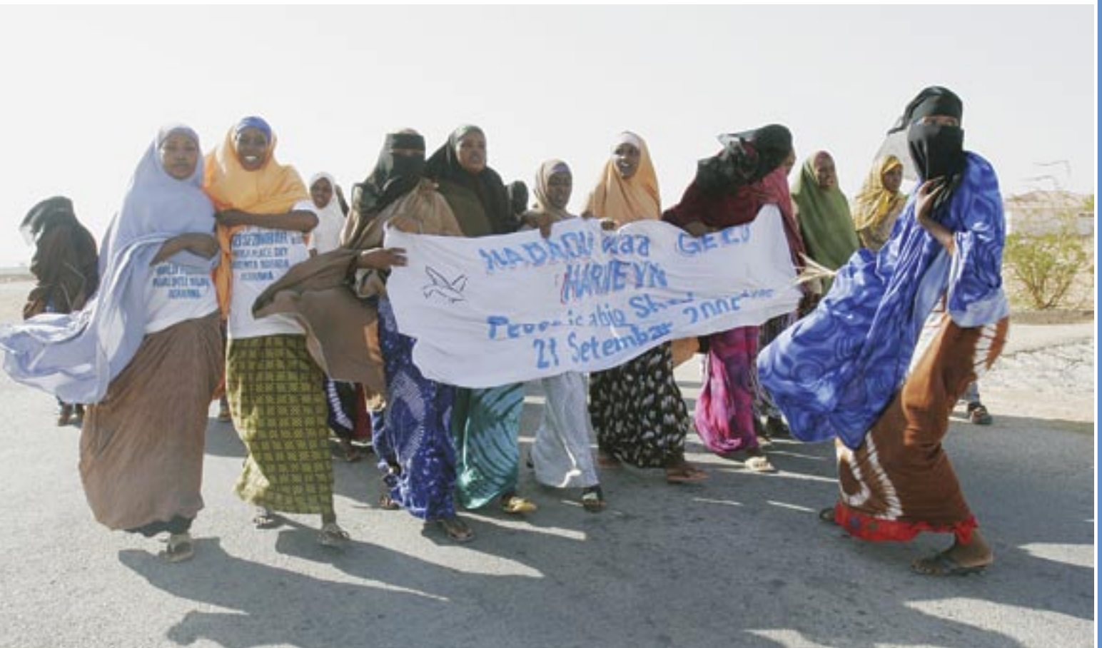
Nabad waa lagu hirtaa, colaadna waa laga haajiraa (Peace inspires you, war scatters you) - Somali proverb

This publication was made possible through generous contributions and support from: