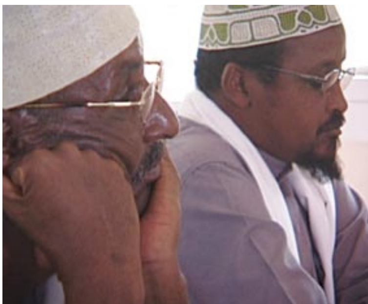
Traditional elders at a meeting in Galkayo.

and General Aideed travelled to Mogadishu to meet with traditional leaders from the region's warring communities. The result, on June 4th, was the signing of the celebrated Mudug Peace Agreement.