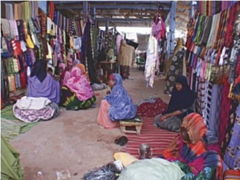
Galkayo market scene.

Even before the escalation of the intra-Habar-Gidir conflict in South Mudug, their neighbours in North Mudug had recognised the critical importance of revisiting and consolidating the principles of the original peace