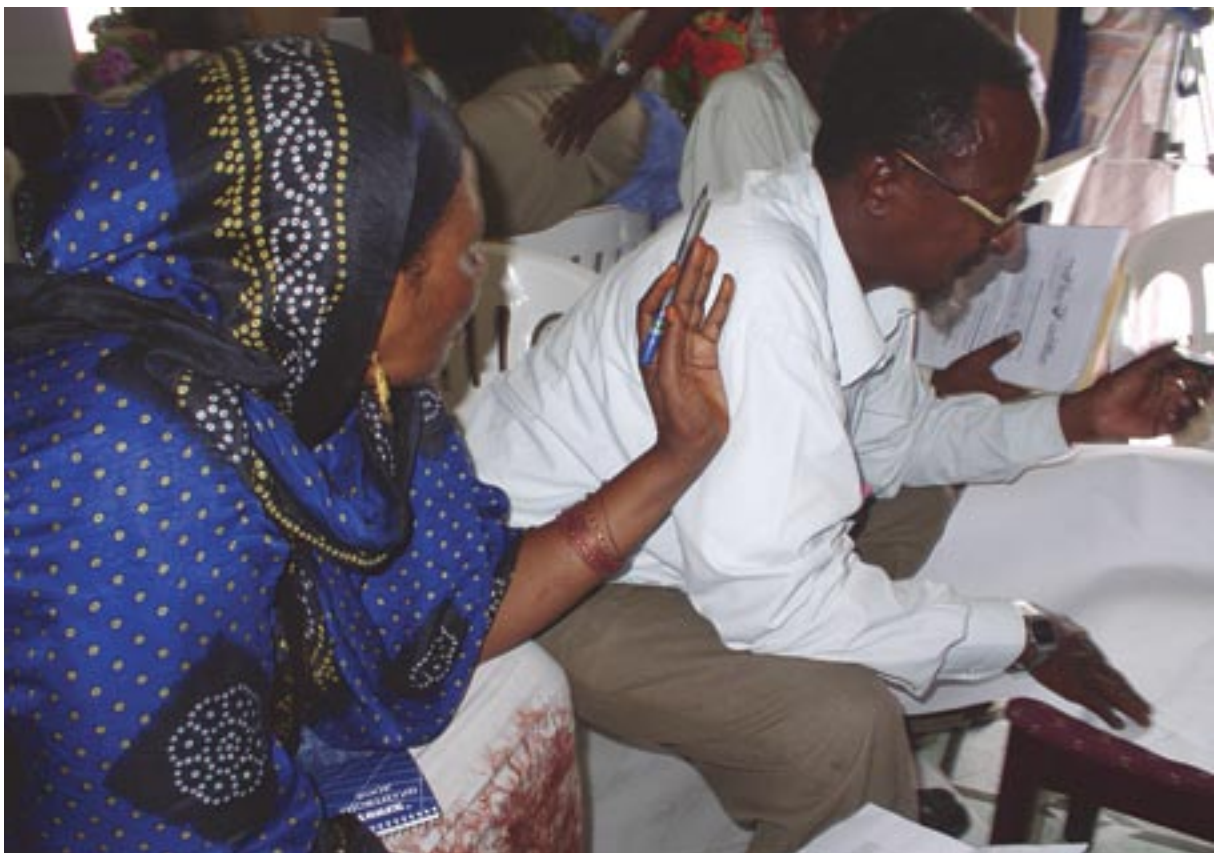
Women's involvement is central to peace-building.

These diverse groups form the majority of the stakeholders invested in peace – and possible conflict – in Mudug. While interaction between many of these groups is sporadic, if not non-existent, it was clear to the researchers that it would be essential to engage them all in dialogue if any clear and consensual progress was to be made.