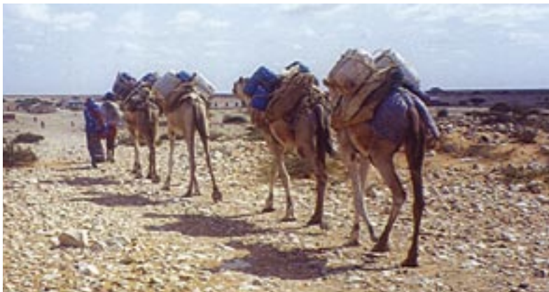
Loaded camels in Jiriban.

As a region of diverse clans and strategic geo-political importance, central Somalia has gained a reputation as an ‘epicentre’ of the country’s civil strife – and of its recent efforts towards reconciliation. Long before the birth of the Somali state, Mudug was a hotspot for clashes between the Habar-Gidir and Majeerteen – sub-clans of the Hawiye and Darood – who traditionally fought over its scarce water and grazing lands. As opposition to the authoritarian rule of Siad Barre increased in the late 1970s, the dictator deployed a ‘scorched earth’