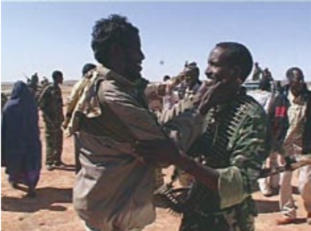
The joyful exchange of prisoners of war between Somaliland and Puntland.

Traditionally inhabited predominantly by the hardy nomadic herders of the Harti sub-clan, the sun-scorched mountains and arid plateaux of Sool and Sanaag are fiercely contested between Puntland and Somaliland.