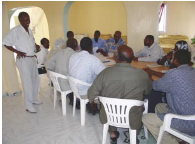
Group discussion on conflict management.

Although the schedule of these activities had – inevitably – to be adapted according to unfolding political developments, the PDRC got off to a strong start with a comprehensive assessment of the current situation in Mudug. The assessment, compiled during three days of discussions in Galkayo from March 6th-8th 2005, appraised the current political and military situation, the relevance of the TFG-appointed South Mudug Reconciliation Committee (consisting of a coordinator,