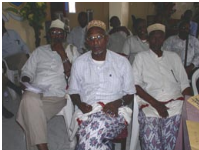
Elders at one of the workshops on conflict management.