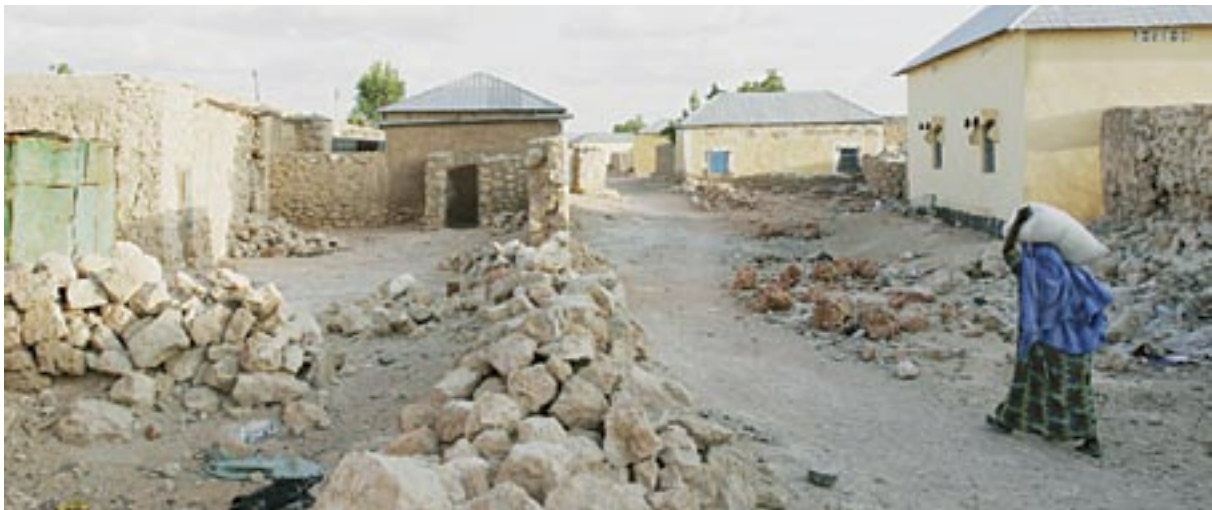
Rebuilding houses in Galkayo.

exist in Galkayo – although divided by a ‘ de facto line’ – and traditional elders of both clans have attempted to manage the chronic insecurity across the divide. In recent years, the battle-scarred city has emerged as a vibrant and highly successful centre for Somalia's livestock and commodities trades. Nevertheless, the sharp contrast between the establishment of governance and rapid social and economic growth in North Galkayo and the lack of development and ensuing poverty south of the ‘ de facto line,’ combined with continuing problems of insecurity and crime, reflect the need for a comprehensive resolution of outstanding differences to allow for lasting peace and cohabitation.