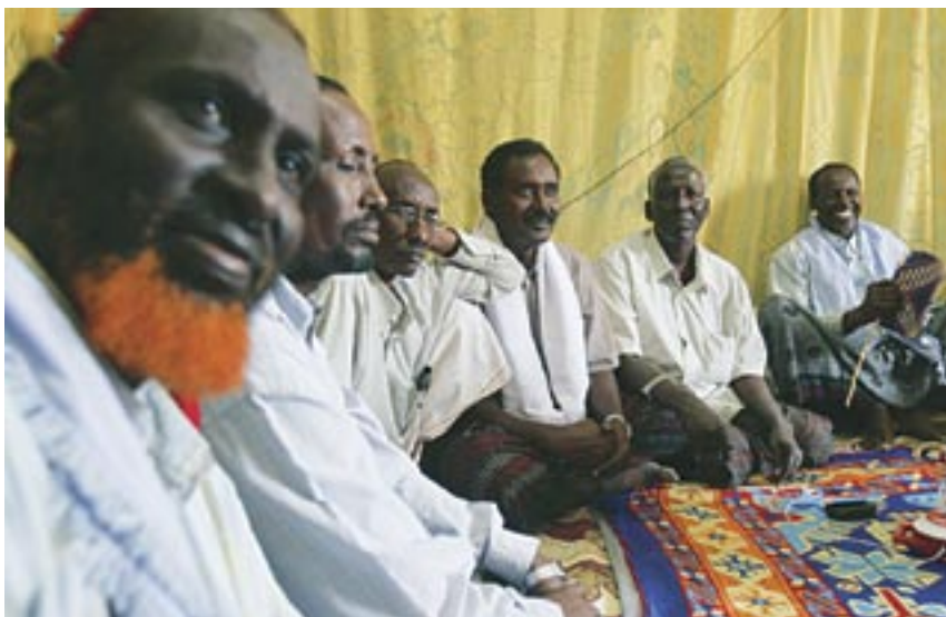
Dialogue amongst elders in South Galkayo, September 2005.

Since the Galkayo meeting in February, the reconciliation process in South Mudug and Galguduud has continued to make considerable progress and receive support from a broad variety of political and civic players, including the Puntland administration, which has provided material and financial assistance to the disengagement of the militias. The WSP/PDRC/CRD partnership has made the conflict a specific focus of its peace-building activities under the Dialogue for Peace programme. In late March, following a series of meetings by WSP and the CRD in Nairobi with a number of political actors involved in Mudug, the CRD director visited