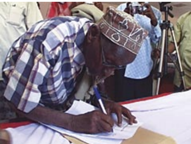
Signing the Ramada agreement.