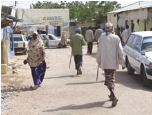
Galkayo street scene.

in the north, and Galdogob, on the Ethiopian border, to coastal Hobyo and Harardheere on the border with Galguduud. Despite its strategic importance, however, there are no clearly demarcated boundaries between Mudug's districts, or between its various clans and sub-clans – a problem common to many parts of Somalia.