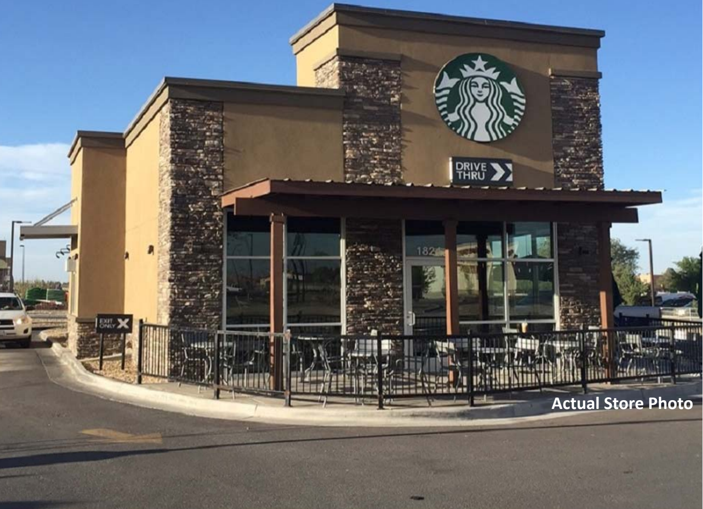
Actual Store Photo

1824 West Joe Harvey Blvd. Hobbs, NM 88240