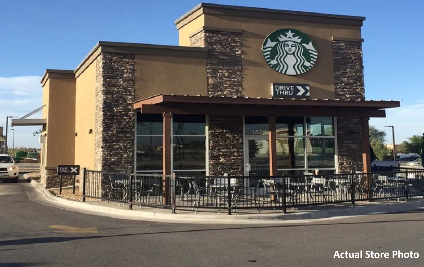
Actual Store Photo

1824 West Joe Harvey Blvd. Hobbs, NM 88240