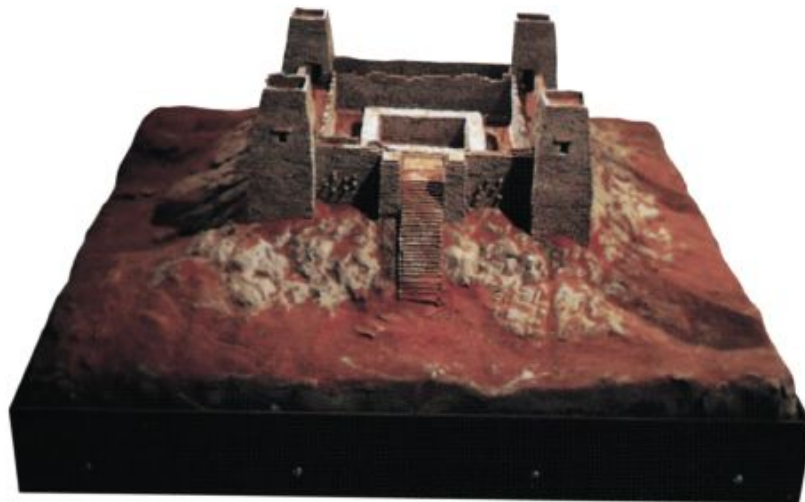
Charles Simonds, Untitled , 1982

8 Simonds's sculptures convey a sense of history but they are his own archaeological interpretations. 9 They arent miniature reconstructions. 10 Of actual buildings or sites.