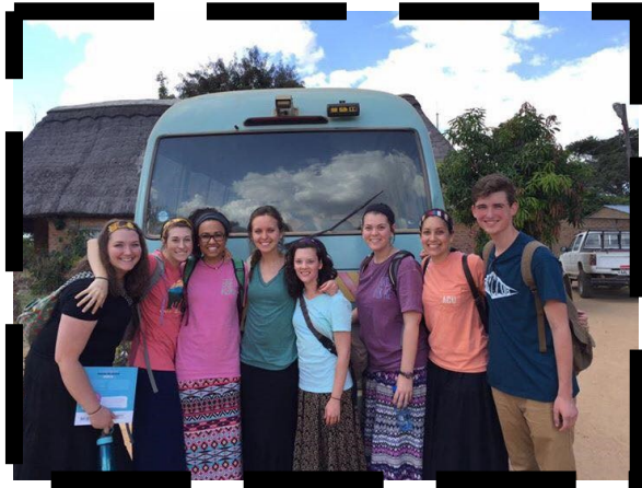
Harding University Graduate Students at the Haven