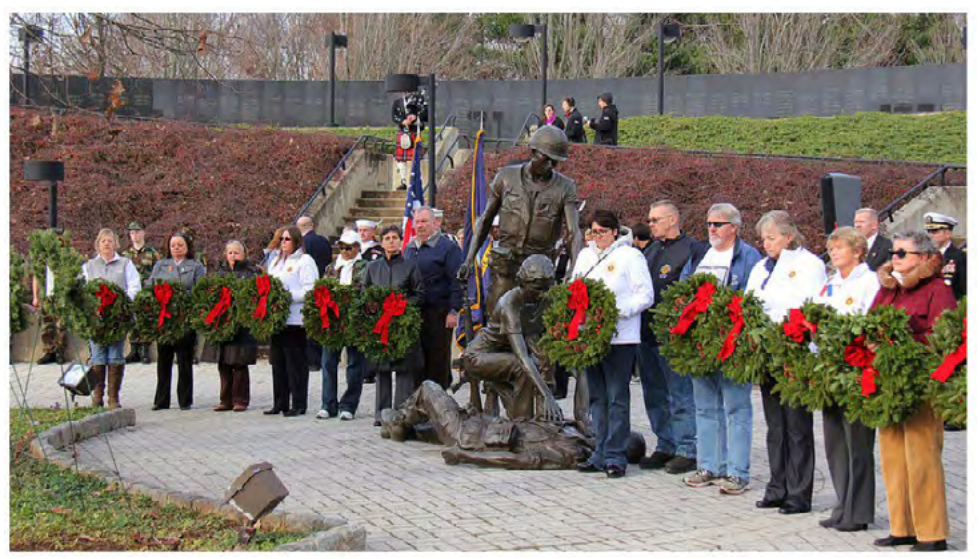
Gold Star Families prepare to present wreaths during a Wreaths Across America ceremony held at the New Jersey Vietnam Veterans Memorial.

Holiday Remembrance Wreaths Honor Vietnam's Heroes