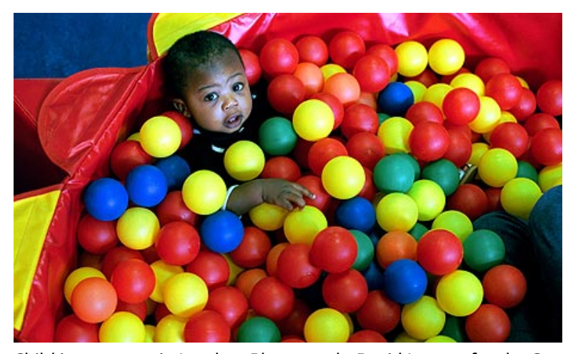
Child in a nursery in London.

How high are childcare costs in the UK? And how much worse is it than the US, Germany and France? . .