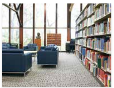
THE WIGMORE MUSIC LIBRARY

There are over 3000 students studying within the Faculty of Arts which is one of the founding faculties of the University. It comprises of three schools; the School of Humanities, the School of Social Sciences and the School of Music.