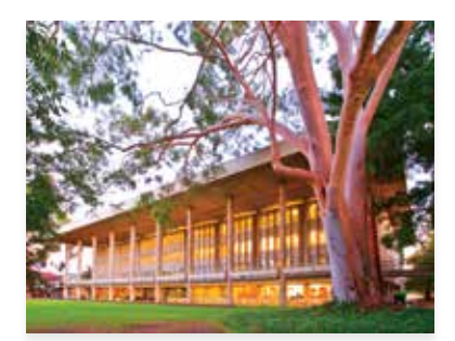
THE REID LIBRARY

The faculty incorporates a multimedia centre, language laboratories, a recording studio, an archaeology laboratory, rehearsal spaces, practice rooms, a concert auditorium as well as lecture rooms, theatres and study areas. Adjacent to the faculty is the magnificent Reid Library which combines resources for both Arts and Business students and there is a separate modern music library located at the School of Music buildings.