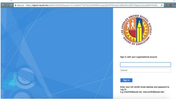
Step 1: Login at https://clever.com/in/lausd?skip=1