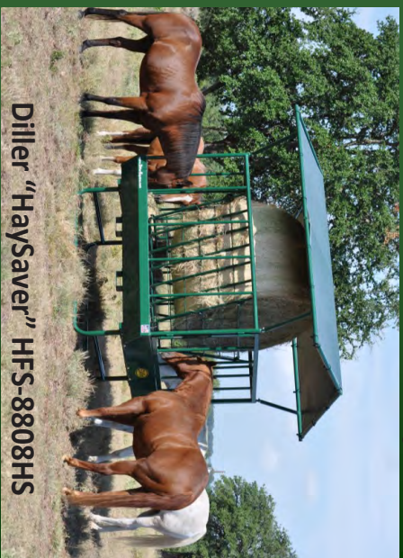
Diller "HaySaver" HFS-8808HS