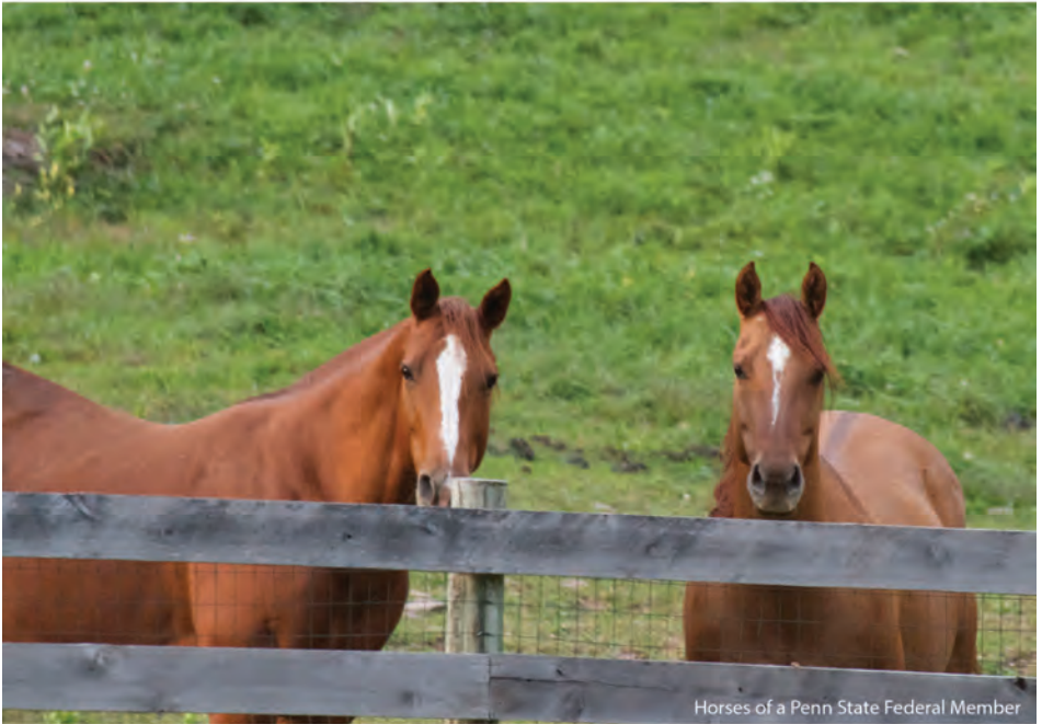
Horses of a Penn State Federal Member

I used to have money. Now I have horses!