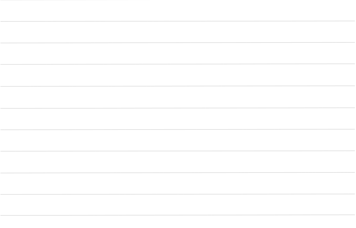
Done? Good. Now burn the list.

1. Write out your perfect man checklist and list all of the character traits of your mythical Mr. Right. This includes all of the ways you sort, sift, and screen potential partners. Some ideas to get you started are his hair color, height, ethnicity, age, occupation, and income. Is there any type you won't date or even consider giving a second look?