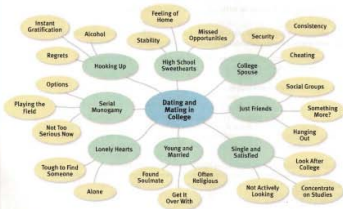
FIGURE 2.2 Creating a Concept Map About Your Topic

As your map fills out, you might ask yourself whether the topic is too large for the amount of time you have available. If so, pick the most interesting ideas from your map and create a second concept map around them alone. This second map will often help you narrow your topic to something you can handle.