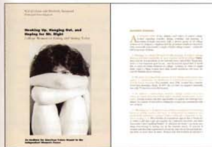
FIGURE 2.3 A Report on Your Topic

Dating and mating in college is a very large topic—too large for a five- to ten-page paper. But if you write a paper that explores a specific angle (e.g., the shift from a hooking-up culture to a culture of serial monogamous relationships) you can say something really interesting about how people date and mate in college.