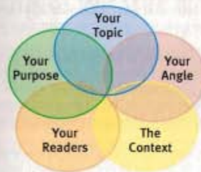
FIGURE 2.1 Five Elements of the Rhetorical Situation

Gaining a clear understanding of your topic, angle, and purpose will help you decide which genre is most appropriate for your writing project.