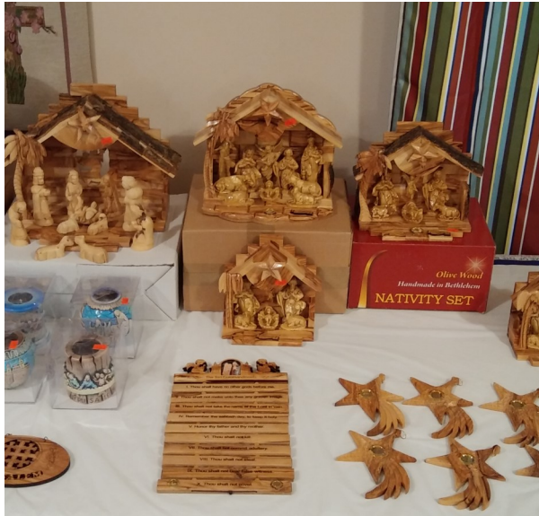
Holy Land Carvings