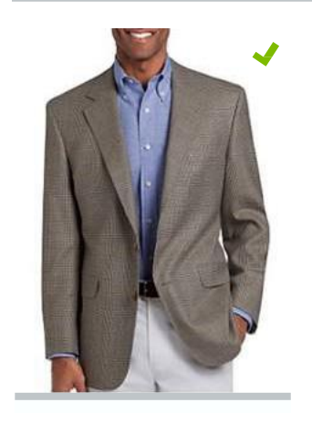
Dress Code Monday through Friday