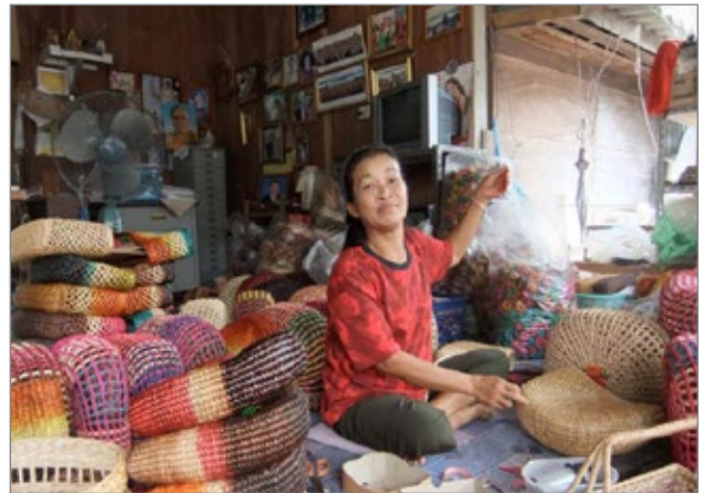
NGEW PAYAHO, CHIANG RAI, THAILAND: As part of an informal workers group affiliated with HomeNet Thailand this woman weaves and colors bags.