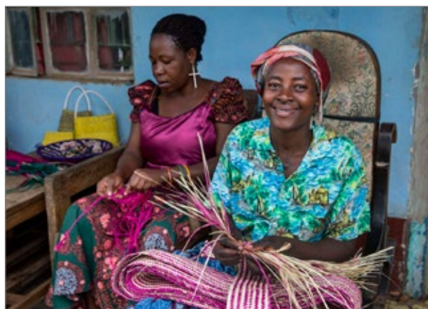
TORORO, UGANDA: Members of the Kaku women's group are weaving baskets to sell in local markets.

As a practical matter, given our limited capacity to work in-depth in individual countries, we expect to engage closely with regional institutions and think tanks. In collaboration we will provide, support, and expand on the technical capacity, in-country partners, and advocacy tools to first demand more and better data, then use that data to research the gendered effects of economic and development policies, and ultimately advocate for changes at the country level. We may also have opportunities to support technical and advocacy organizations that themselves work with partners in multiple countries.