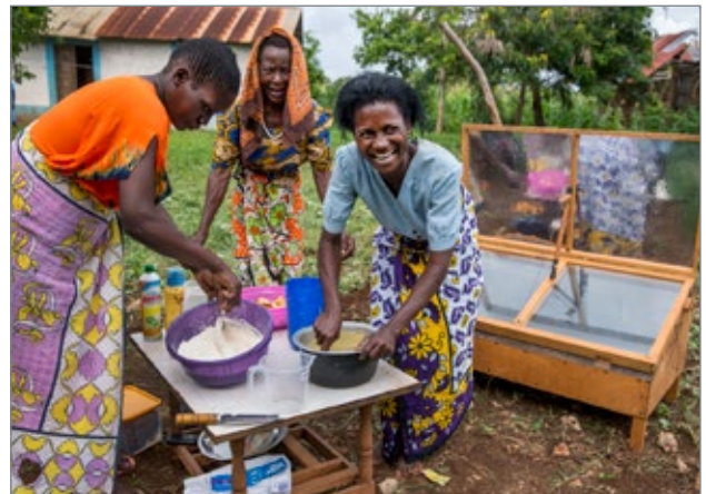
MOMBASA, KENYA: As members of a cooperative group these women bake cakes to sell in their community using a solar oven provided by DSW Kenya.

In implementing this strategy, we will help to build both the evidence base and the capacity of advocacy organizations to use evidence in their strategies to influence economic, social, and development policy changes to consider gender disparities. Our focus will remain in East and West Africa, where we can take advantage of policy opportunities and build on knowledge acquired from other work in these areas.