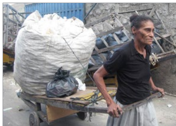
BELO HORIZONTE, BRAZIL: This woman is a waste picker, known as catadores in Brazil, with the cooperative ASMARE.

The tendency toward economic policymaking that ignores gender is particularly unfortunate in sub-Saharan Africa, where most nations are aggressively looking for new ways to generate jobs. For example, countries with growing oil, gas, and mining industries want their local economies to benefit from foreign investment in ways that reach beyond royalties and tax revenues; they want to develop local industries that serve growing supply chains. These include trades like trucking, machinery repair, provision of uniforms, and food service. But policies to open up procurement competitions for local firms are not currently designed in a way that fosters opportunities for women. Instead, emphasis is placed on sectors like transportation that require large capital investments, while opportunities that might be more open to women tend to be ignored or given very low priority.