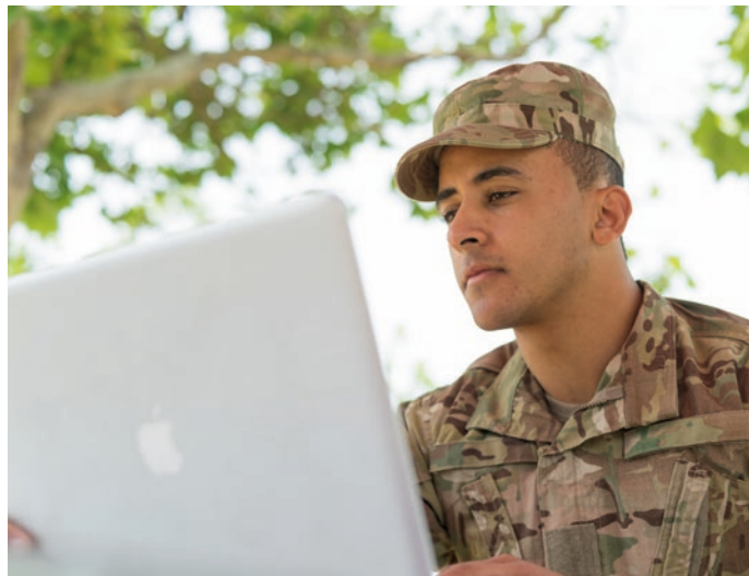
The appearance of U.S. Department of Defense (DoD) visual information does not imply or constitute DoD endorsement.