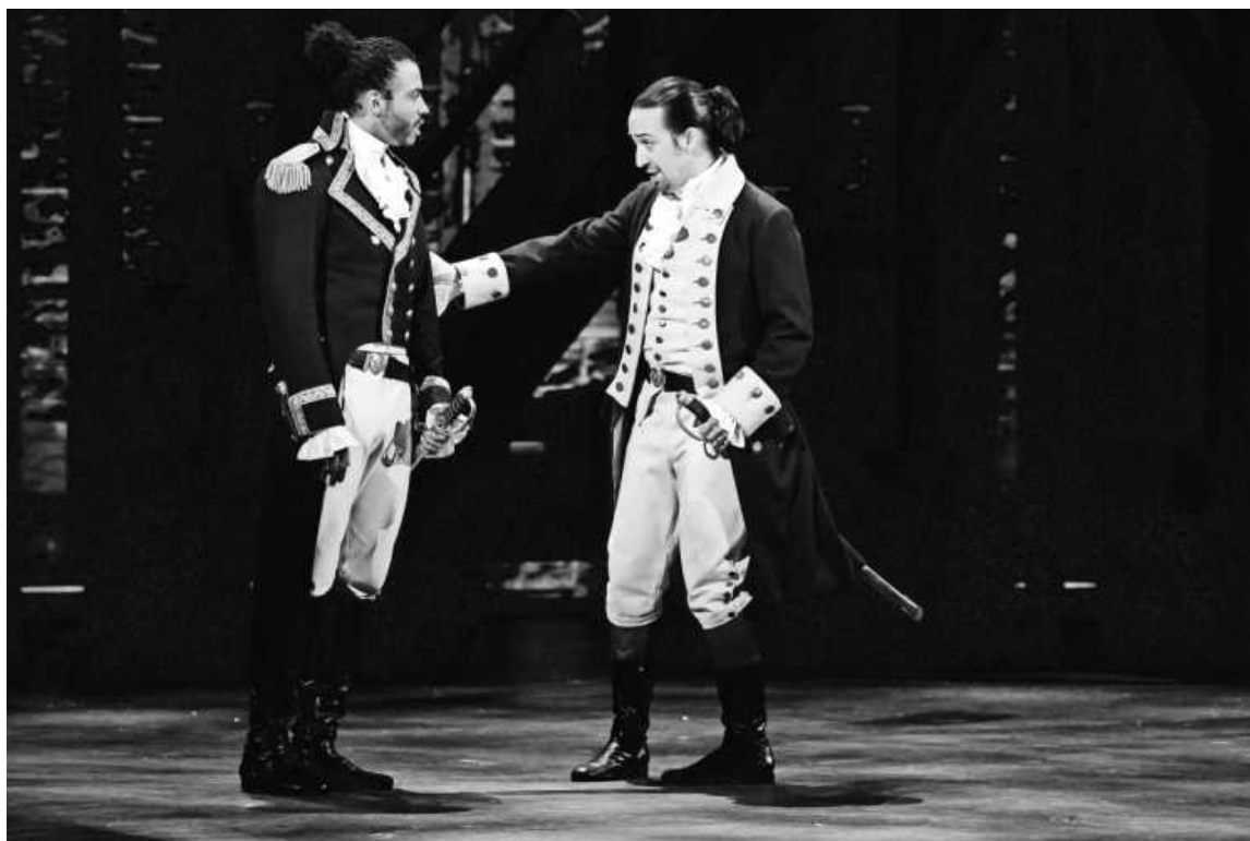
Daveed Diggs and Lin-Manuel Miranda perform a scene from Hamilton at the Tony Awards in June.