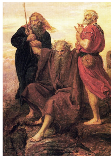
VICTORY O LORD! by John Everett Millais (d. 1896)

The following excerpt is attributed to Pope St Clement (d. ca. 101) though it was likely the work of an anonymous author in the first half of the 2nd century (ca. 120-140). He says we sin if we think little of salvation. He stresses the need/importance of ongoing repentance and self-control for all who would profess the Christian faith. Italics added.