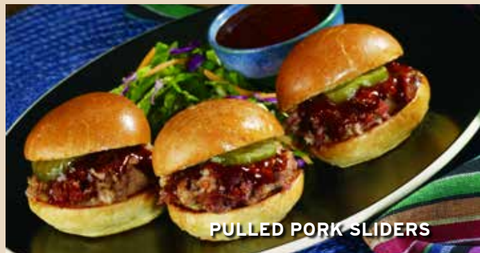
PULLED PORK SLIDERS

Burgers and Sandwiches are served with cole slaw and fries.