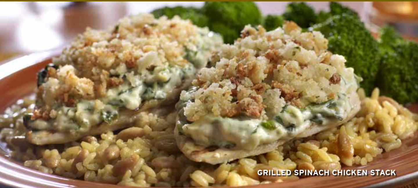
GRILLED SPINACH CHICKEN STACK

SENSATIONAL FRESH INGREDIENTS. At Tony Roma's, we take pride in using the freshest greens, herbs, fruits, vegetables, meats and seafood for our salads and entrees. It's part of a tradition that includes making dozens of items from scratch every day – like mixed vegetables, oven-baked desserts, hand-mashed potatoes with real cream, sauces, marinades, dressings and original steak and seafood toppings. But the quality doesn't stop there. Our innovative cooking techniques and attention to service help us deliver individually crafted dishes and memorable meals. Tony Roma's captures the flavor of fine dining at affordable prices.