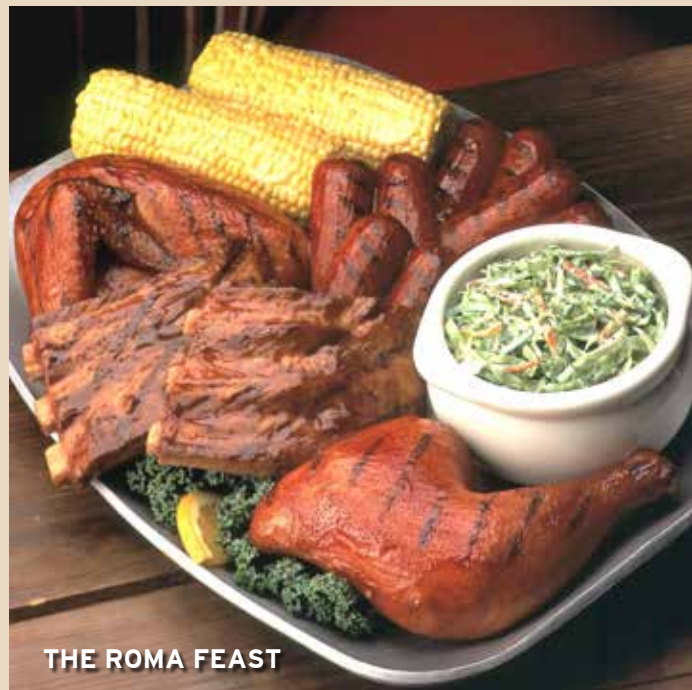
THE ROMA FEAST

Ideal to be shared by 2. Carolina Honey's™ ribs served with BBQ chicken, grilled sausage, corn on the cob and cole slaw. 60.00