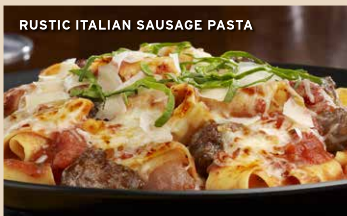
RUSTIC ITALIAN SAUSAGE PASTA

Linguine with sweet lamb sausage tossed in roasted Marinara and Basil Pesto sauce. Complete with melted Italian cheese and fresh Basil. 22.90