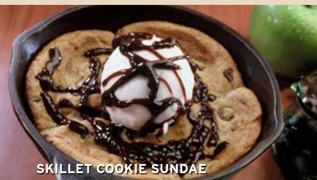
SKILLET COOKIE SUNDAE

A giant chocolate chip cookie topped with a scoop of vanilla ice cream and chocolate fudge. 11.90