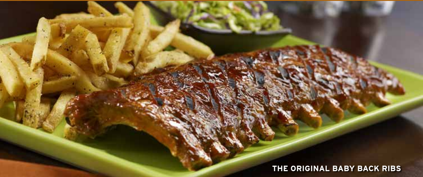
THE ORIGINAL BABY BACK RIBS

THIS IS THE STUFF THAT LEGENDS ARE MADE OF. The finest pork ribs, richly seasoned with select spices, slow-smoked to mouthwatering perfection. Basted with your choice of one of our Signature Sauces: Original, Carolina Honey's™, Bourbon BBQ or Tony Roma's Red Hots™.