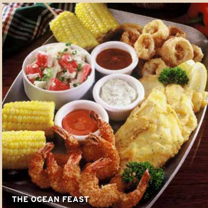
THE OCEAN FEAST

Fried Shrimp and Salmon Piccata are served with two choices of cole slaw, baked potato, mashed potatoes, french fries, ranch style beans, rice, broccoli or corn on the cob.