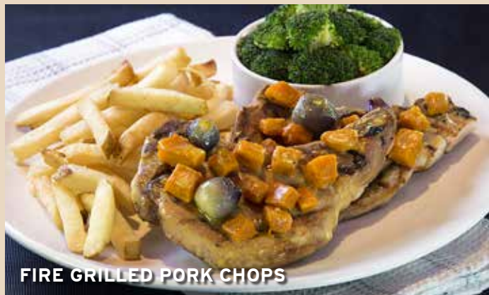
FIRE GRILLED PORK CHOPS

Juicy, marinated pork chops grilled to perfection and topped with praline bacon, pumpkin and onions. 27.90