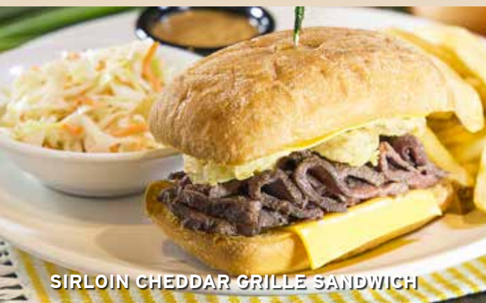
SIRLOIN CHEDDAR GRILLE SANDWICH

A marinated chicken breast topped with mushrooms, onions and Monterey Jack cheese. 15.90