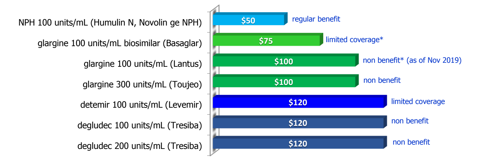
Figure 1: British Columbia PharmaCare Coverage and Approximate Cost of a 30-day Supply of Basal Insulin for People with Type 2 Diabetes

Cost based on 1500 units which is roughly a 30-day supply at 0.6 units/kg/day for an 87 kg person; wholesaler drug cost without markup; each test strip plus lancet adds approximately $1.35 per glucose test [calculated from McKesson Canada https://www.mckesson.ca/ (Accessed May 21, 2019)]