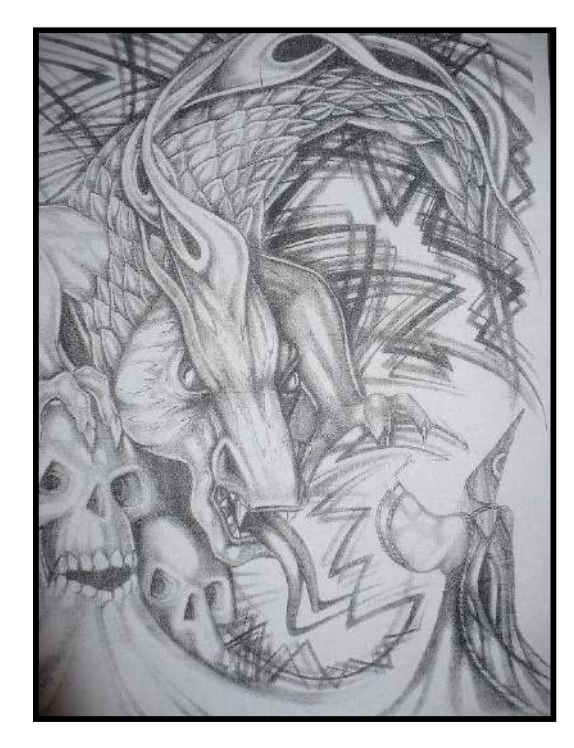
And Here we have a picture of mine called....Ostara