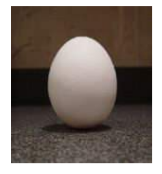
Photo of an egg successfully balanced on end... three weeks before the vernal equinox!