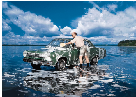
Figure VI-5. Help protect the watershed by taking autos to a professional carwash where water is recycled and treated or wash them at home on a permeable surface such as the grass or gravel.