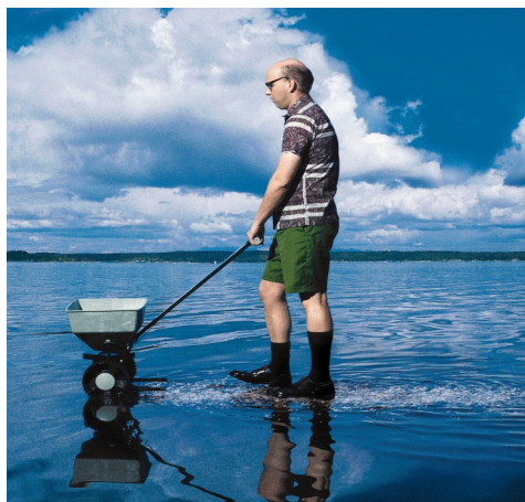
Figure VI-1. Fertilizers, pesticides, and other hazardous material can get into storm drains and then into our rivers.