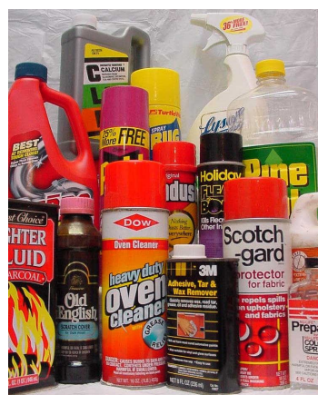
Figure VI-2. Examples of hazardous household products.

Latex or oil-based paints, paint thinner, furniture stripper, varnish, stains, WD-40.