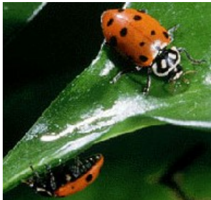
Ladybugs are one of many beneficial creatures that can provide natural protection from pests.

There are, however, many effective, inexpensive, and environmentally friendly pest control options for the home gardener. The easiest and most straightforward is to prevent pests from getting into your garden in the first place. Choose plants (such as catnip and marigolds) that repel certain pests, or others (such as sweet alyssum and dill) that attract pest-eating insects. Ask your neighborhood garden shop which plants work best against the local pest population. Furthermore, since pests and disease thrive in decayed plant matter, it also helps to keep your garden tidy.