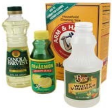
Figure VI-3. Safe alternatives to some household hazardous products.

Laundry detergents, although not generally thought of as hazardous, can cause water quality problems because they are used so extensively. They are a source of phosphorus, zinc and arsenic and some contain compounds that do not degrade in the sewage treatment process. Phosphorus causes algal blooms in waterways robbing fish of their oxygen supply. The Portland area has banned the sale of phosphate-containing laundry detergents. Households whose laundry consists mainly of natural fabrics can successfully switch to soaps, such as White King, where water is soft. If water is hard, it can be softened by adding borax or washing soda.