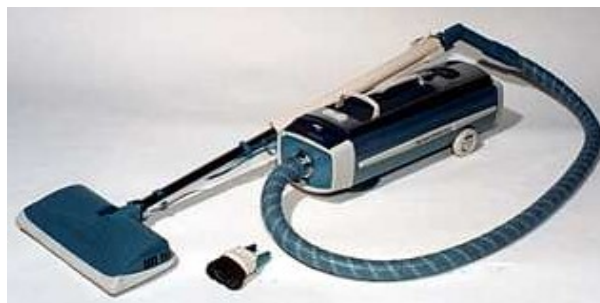
Figure VI-4. Vacuuming is the principle non-chemical control method for clothes moths. Be sure to remove cushions from stuffed furniture and reach into crevices. Immediately remove and discard the vacuum bag.

Never mix chemical products. Mixing hazardous products can start a chemical reaction that could create highly toxic fumes or cause an explosion.