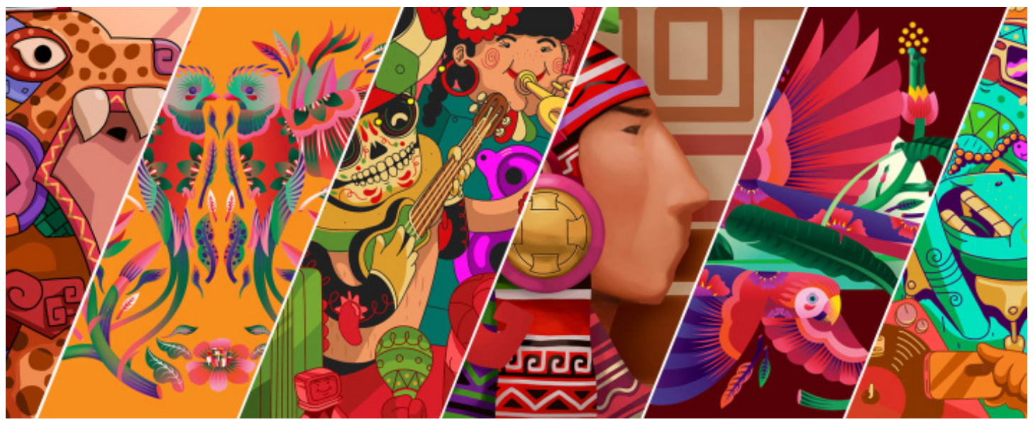
Three artists contributed to the Mi Cultura Gallery in Wells Fargo's Card Design Studio®, the latest in a series of collections that help celebrate diversity, culture, and community. Read more.

Wells Fargo & Company (NYSE: WFC) is a leading financial services company that has approximately $1.9 trillion in assets, proudly serves one in three U.S. households and more than 10% of small businesses in the U.S., and is the leading middle market banking provider in the U.S. We provide a diversified set of banking, investment, and mortgage products and services, as well as consumer and commercial finance, through our four reportable operating segments: Consumer Banking and Lending, Commercial Banking, Corporate and Investment Banking, and Wealth & Investment Management. In the communities we serve, the company focuses its social impact on building a sustainable, inclusive future for all by supporting housing affordability, small business growth, financial health, and a low-carbon economy. News, insights, and perspectives from Wells Fargo are also available at Wells Fargo Stories.