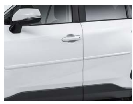
Body side moldings