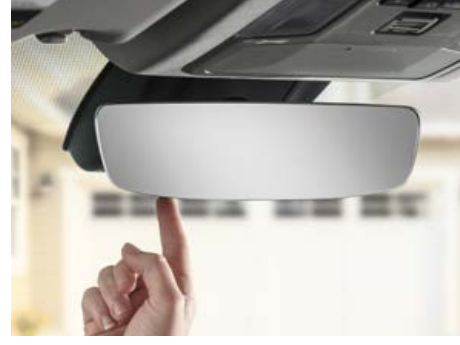
Frameless HomeLink®39 mirror