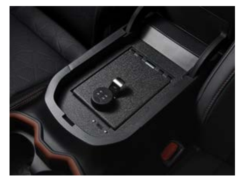
In-vehicle safe by Console Vault®

This is a great way to add extra personality to your RAV4. Not every accessory is available in your area, so for a complete list of accessories, go to toyota.com/rav4/accessories.