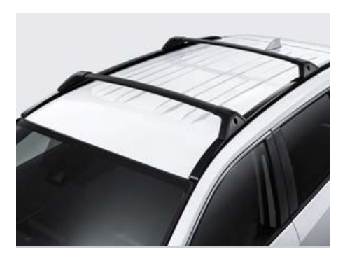
Roof rack cross bars