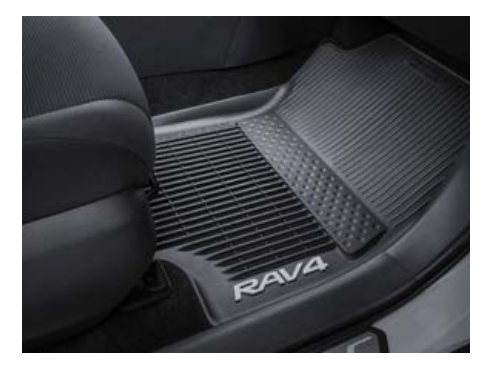
All-weather floor liners<sup>43</sup>